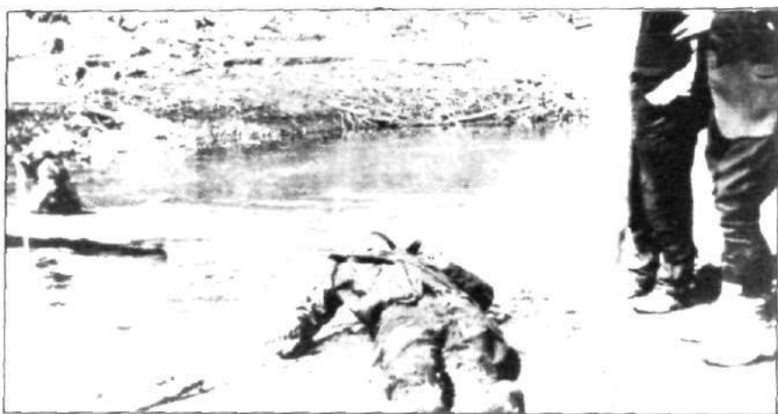
Body of Rosvall as found on the bank of the creek.