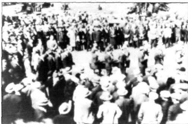
The funeral.