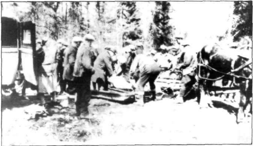
The body of Voutilainen transferred from horse sled to motorcar on Onion Lake Road.