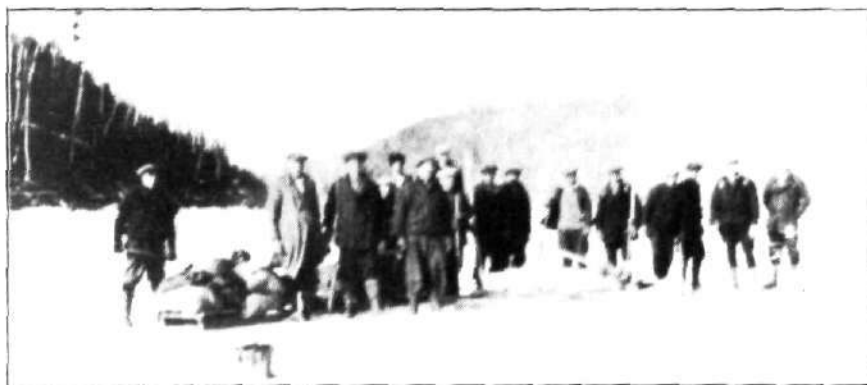
Search party of unionists on Onion Lake.

While the search party went looking for Rosvall and Voutilainen, the union also submitted a story of their disappearance to the local paper. This time they