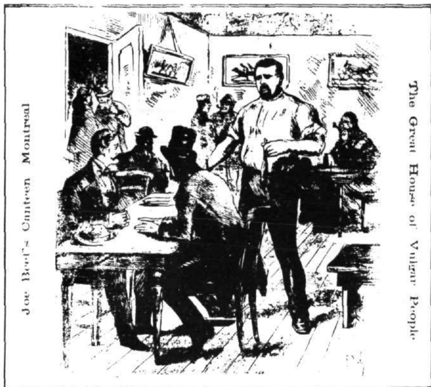
Joe Beef's Canteen Montreal