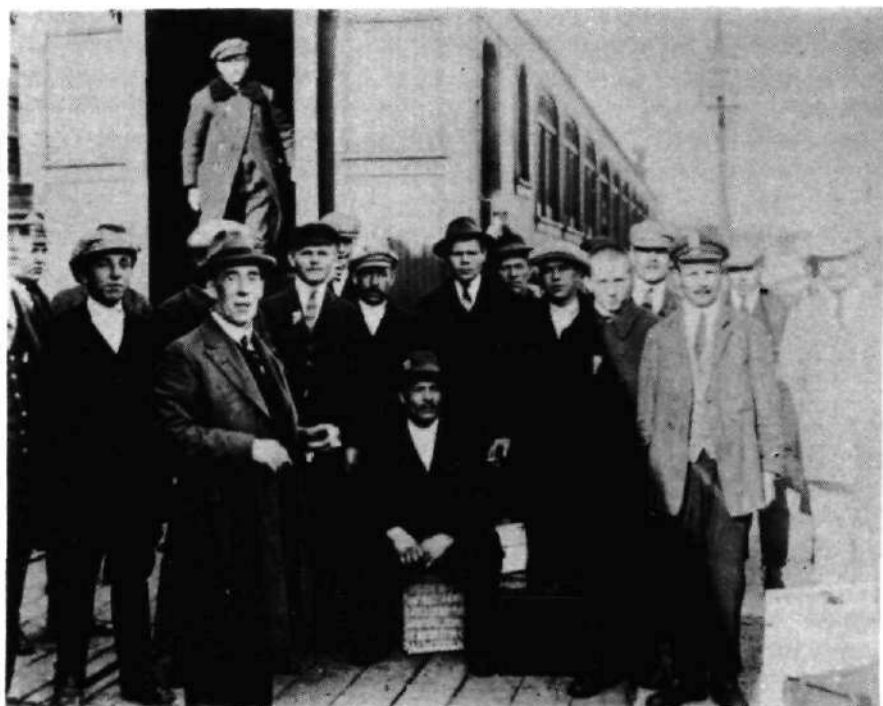
Men in front of a train car.