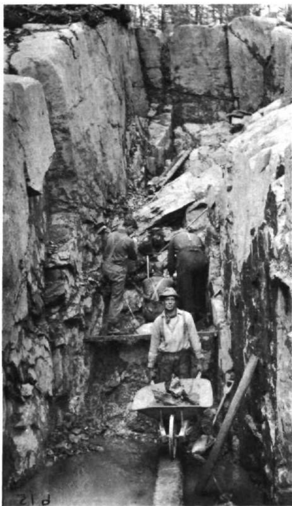
Open-cut mining practices.

reading material was provided, suitable movies were selected, and consumption of alcohol was limited. Perhaps most important, the growth of union activities could be checked before they had a chance to take root.