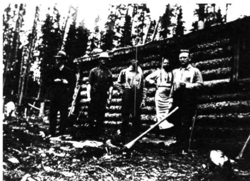
This is a typical bunkhouse in the Cobalt camp. (Noranda Mining Company).

The erection of bunkhouses allowed the mining companies to exert greater control over the extra-curricular activities of its employees than would otherwise have been possible. Recreation pastimes were directed and supervised by the company's staff, "proper"