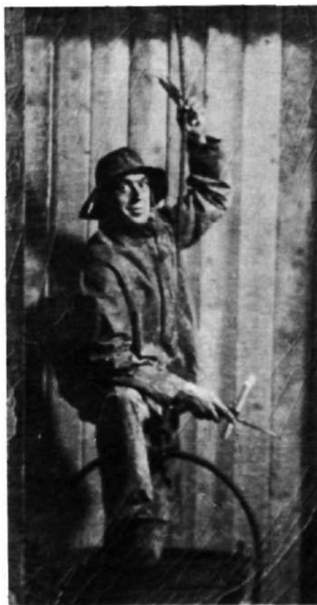
The miner, dressed in wet clothes, is about to descend into the shaft perched on an ore bucket. Note the candle in one hand and the dynamite in the other. The photograph was taken from a postcard written in 1907.

discover a valuable ore deposit, sell it for a profit, and return home to live in comfort. These prospectors were followed by the entrepreneurs who were willing to take a chance on the property for a relatively small sum. 2 The first shipments of ore consisted almost entirely of rich silver nuggets taken from surface excavations. This not only permitted the capitalists to purchase machinery and to begin a more systematic development of their property, but also ensured that Cobalt would not become a one-company town. 3