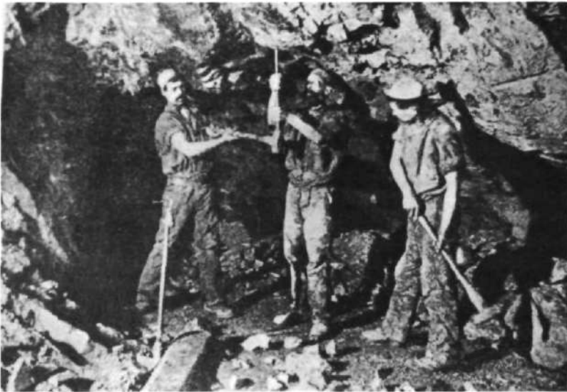
Underhand drilling in a typical stope. (Canadian Mining Journal, 1917).

a hammer. The Right-of-Way Mining Company was laughingly described as "seven men, three planks and a wheelbarrow, to which has been added a couple of candles for the nightshift." 23 The first shafts resembled wells with ladders down the side. They were timbered around the opening and a small bucket was lowered down the shaft by means of a winch or windlass. Although pneumatic rock drills had been introduced into Canada well before the turn of the century, hand drilling was the accepted practice at Cobalt in the first few years, because the owners (many of whom were operating on a shoestring budget) were unwilling to undertake large capital expenses until the silver veins proved out at depth. As usual, it was the miners who bore the brunt of the companies' parsimony. Despite this prevailing fear that the silver veins were only surface deep, modern mining methods were adopted after 1907 and the silver veins were followed to greater depths. Open quarrying gave way to shaft mining. The number of men employed underground increased from 186 in 1905 to 1,089 three years later, and the total value of mining machinery rose to a million dollars. 24