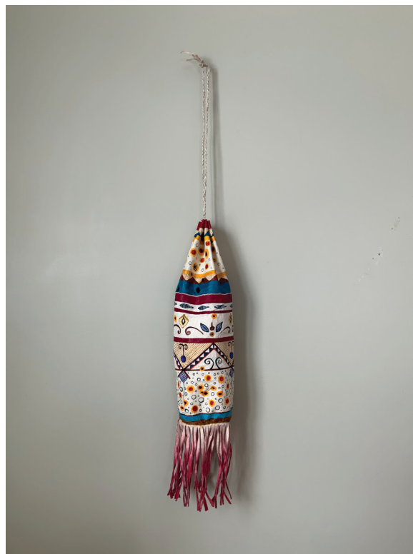
Figure 5: Bag made by Margaret Orr during the project workshops, which she gave to someone as a gift.