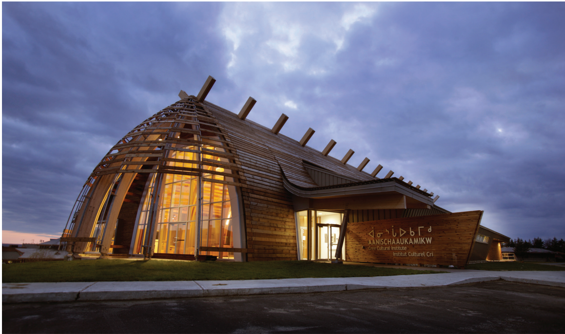
Figure 2: Aanischaukamikw Cree Cultural Institute, 2012.

belongings, nor their ancestry or community lineages, the precise regional origins of these coats can never definitely be known, but our community researchers connected with our ancestors' belongings in ways that cannot easily be described in words on a page.