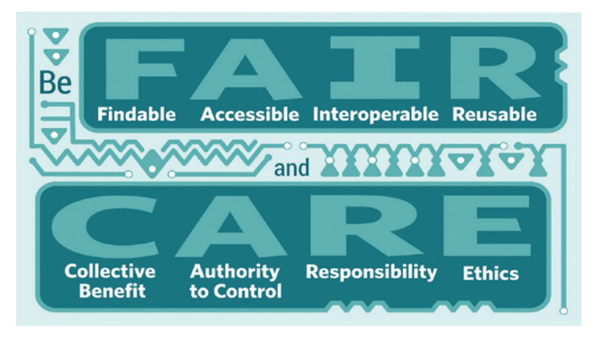
Figure 2: Care Principles for Indigenous Data Governance (https://www.gida-global.org/care).

Of the protocols we mentioned in this paper, the majority have been led and developed by Indigenous people and allies in a model of reconciliation. The success of Local Contexts, for example, relies on Indigenous peoples in their local communities adding meaning and description to the labels. Cultural institutions' role in implementing Indigenous protocols should be that of collaborators that are open to input, who recognize that their records are missing crucial information. Indigenous peoples often carry the heavy relational burden associated with developing these protocols; therefore, their voices must be privileged when discussing matters related to research, relationship-building, and creating protocols. Respectful protocols are an attempt to guide cultural memory institutions in entering respectfully into relationships with Indigenous communities and in facilitating the discussion of matters of importance related to ownership and description of Indigenous tangible and intangible knowledges.