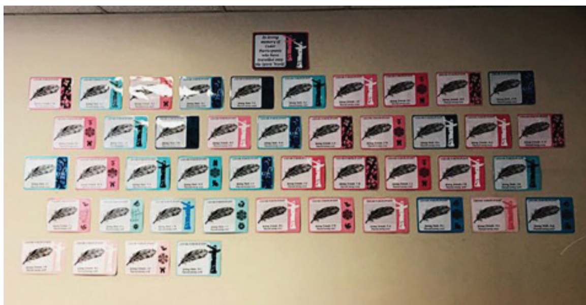
Figure 4: Honouring Cedar Project participants who have passed, Cedar Project Prince George office.

Cedar governance recognizes that developing culturally safe interventions and knowledge translation materials that address the complexity of HIV and HCV vulnerability among young Indigenous people requires multidisciplinary contributions within an environment that supports safe, constructive, and meaningful dialogue. Extensive knowledge translation and community engagement is a hallmark of the Cedar Project Partnership.