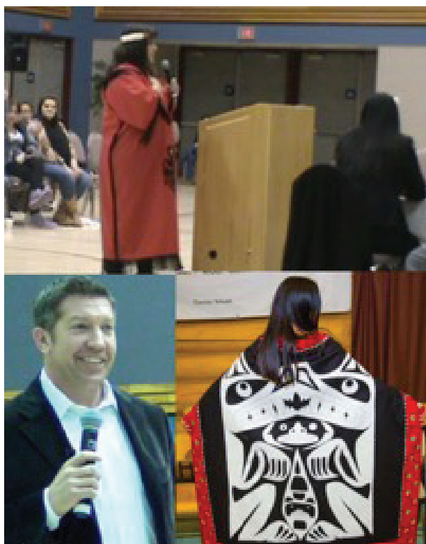
Figure 5: Cedar Project Potlatch, 2013.

Cedar governance is the face and voice of Cedar research. Cedar Project Partnership governs us through all knowledge translation, including print, TV, and radio press. The Partnership determines release of findings to the media, emphasizing community relevance, reciprocal responsibility, and privileging Indigenous