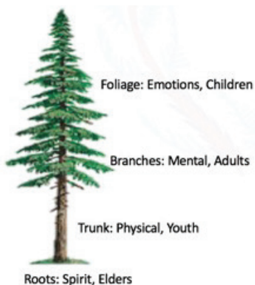
Figure 1: Cedar Project Terms of Reference.

Terms of Reference (Figure 1) in all phases of the research, as part of their commitment to reciprocal accountability.