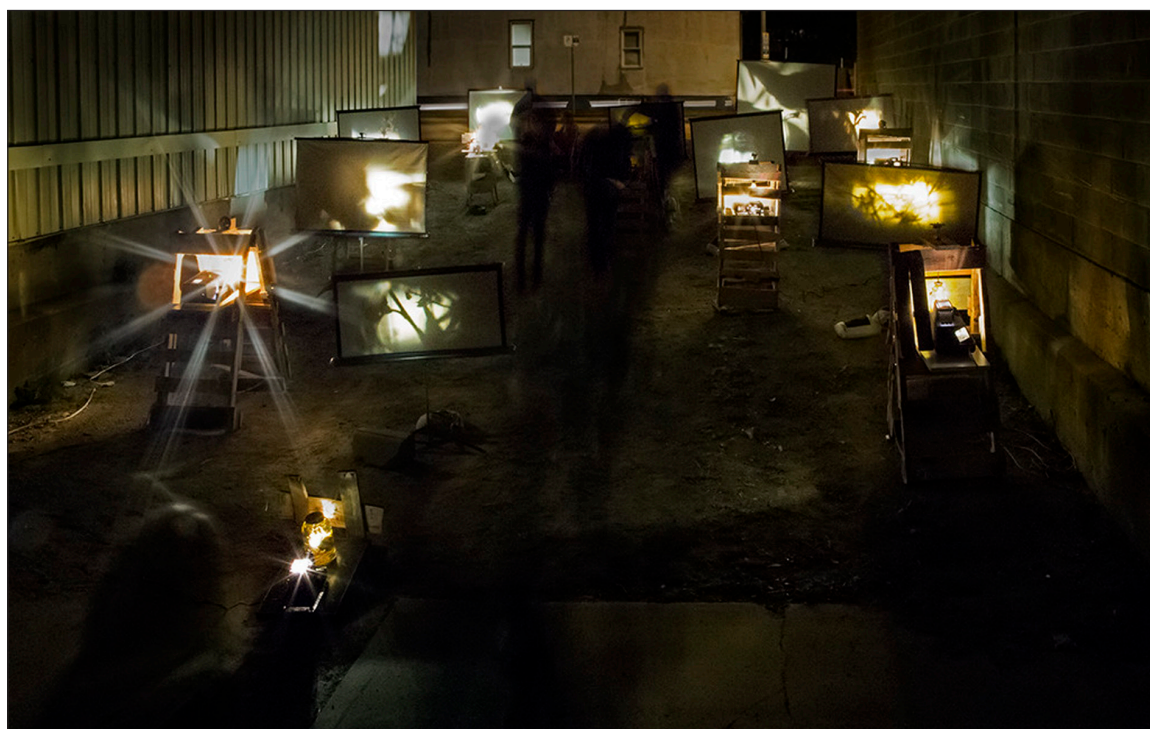
Figure 3: 'Fruits and Flowers of the Spectral Garden' by Laura St. Pierre and Jon Bath. Nuit Blanche Saskatoon 2014. Available here .