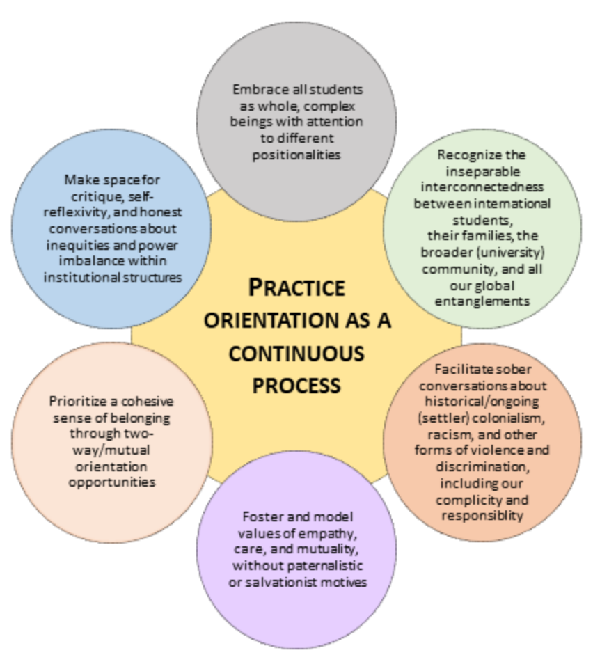
Figure 1: International student orientation re-imagined: A conceptual framework for orientation programming.

Orientation can be so much more than a slide deck presented in a lecture hall. We might learn from educators such as Rogers (2019), who shares their journey towards a pedagogy seeking to enact cognitive justice by valuing a plurality of knowledges and inviting international students to join as co-investigators of knowledge. We can also learn from the Gesturing Towards Decolonial Futures collective, which designs pedagogical interventions to uncoercively rearrange colonial desires (Spivak, 2004). Their Letter to prospective immigrants to what is known as Canada , for example, extends "an invitation to make space" for difficult "conversations about relationships at the interface between Indigenous and immigrant communities" (2021, para. 2). By reconsidering orientation and notions of integration, we might move away from welcoming desired guests towards relating and learning with each other in a shared world, and all the complexities, power imbalances, and violence that relating and learning entails.