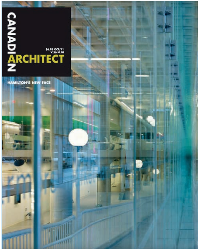
FIG. 13. COVER OF CANADIAN ARCHITECT , VOL. 56 NO. 10 (OCTOBER 2011): GLASS ADDITION TO HAMILTON'S CENTRAL LIBRARY & FARMERS' MARKET WITH VIEW INTO MARKET INTERIOR, 2011, BY TOM ARBAN. COURTESY OF RDH ARCHITECTS / CANADIAN ARCHITECT.

Rare Book Library (Warner Burns Toan & Lunde with Mathers & Haldenby, 1973; Diamond Schmitt Architects, 2022) is a legendary brutalist complex: a fourteen-storey, triangular concrete tower with two smaller, radiating hubs for the Faculty of Information and rare book collection (fig. 14, see also fig. 6). 56 According to Richards, it was conceived as the university's "showstopping" Centennial project. 57 As conservation architect and scholar James Ashby has observed, Robarts was part of a trend of modernist libraries added to Canada's established university campuses that merits further study: