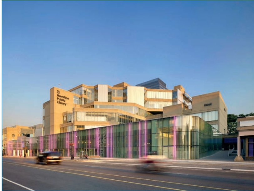
FIG. 12. CENTRAL LIBRARY & FARMERS' MARKET SEEN FROM YORK BOULEVARD, HAMILTON, ON, 2011, BY DPAAI WITH RDH. COURTESY OF DPAAI.