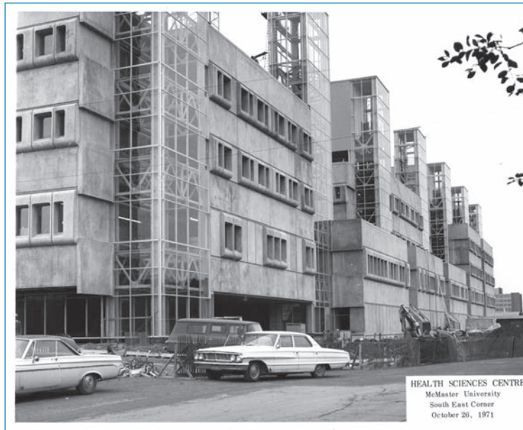
FIG. 7. MCMaster UNIVERSITY MEDICAL CENTRE DURING CONSTRUCTION, 1971, BY DE BRUYN. COURTESY OF HEALTH SCIENCES ARCHIVES, MCMaster UNIVERSITY.