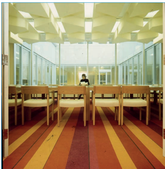
FIG. 5. INTERIOR VIEW OF THE MCMASTER UNIVERSITY MEDICAL CENTRE, HAMILTON, ON, 1971, BY CRAIG, ZEIDLER & STRONG ARCHITECTS.