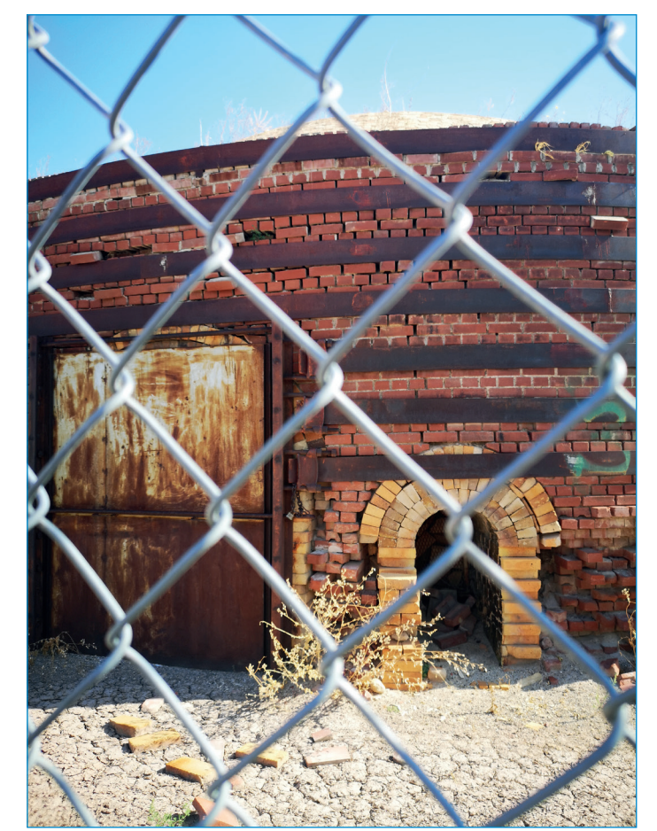
FIG. 13. A FENCED-OFF KILN BELONGING TO THE ABANDONED HYCROFT POTTERIES LIMITED, SEPTEMBER 2022. BANAFSHEH MOHAMMADI.