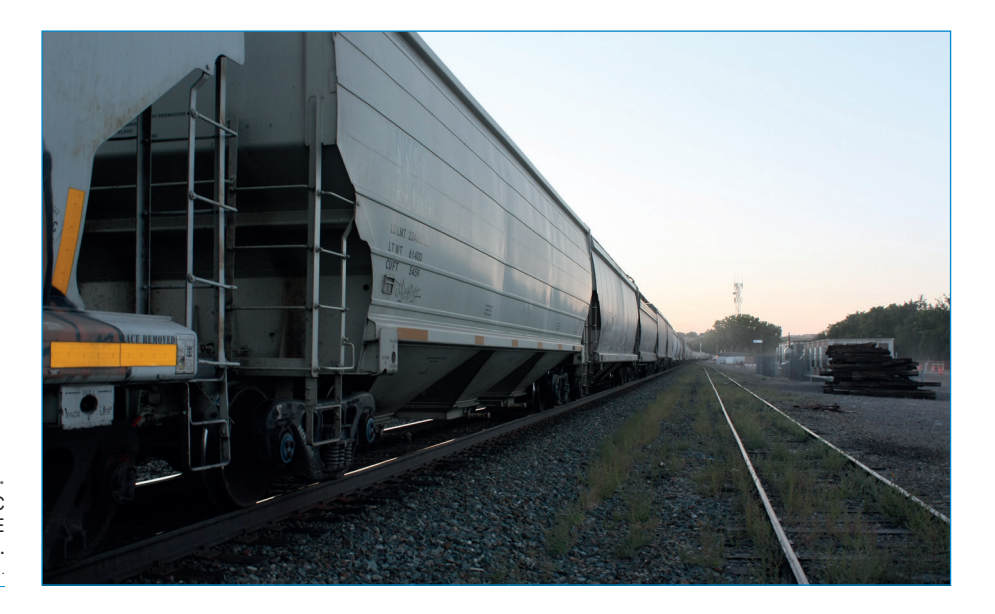
FIG. 3. THE CANADIAN PACIFIC RAILWAY IN MEDICINE HAT, SEPTEMBER 2022. SAJAD SOLEYMANI YAZDI.