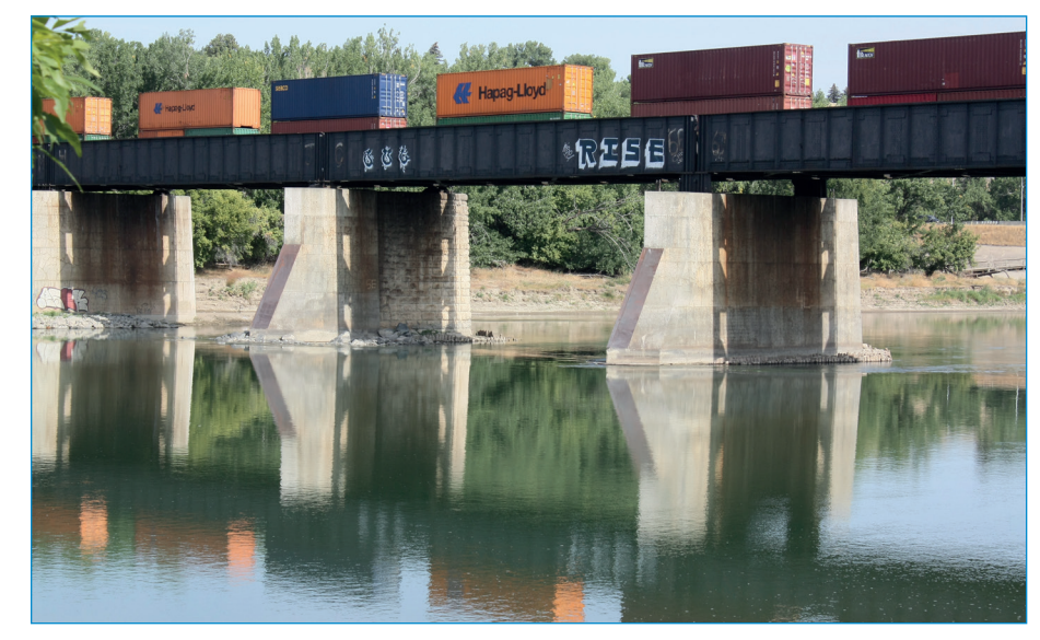
FIG. 2. SOUTH SASKATCHEWAN RIVER AND THE CANADIAN PACIFIC RAILWAY IN MEDICINE HAT, SEPTEMBER 2022.

Known by its colonial name Medicine Hat,<sup>5</sup> an adaptation of the Blackfoot word Saamis , the city is in the southeastern part of the province of Alberta, close to the border with Montana. It is home to the Blackfoot, Cree, Assiniboine, and Métis Peoples.<sup>6</sup> With a population of 65,203, Medicine Hat is the sixth largest city in Alberta and the 89<sup>th</sup> largest in Canada.<sup>7</sup> It was incorporated as a city in 1906, a year after Alberta became a province, and it was at the time the largest city in southeastern Alberta. Known as the Gas City, Medicine Hat was founded and became prosperous in part due to the discovery of extensive gas wells during the first years of the twentieth century. The discovery was accidental; the Canadian Pacific Railway (CPR) was looking for water while building a bridge across the southern tributary of kisiskâciwanisîpiy, or the South Saskatchewan River, when their drilling hit one of the largest gas fields in North America (figs. 2 and 3).<sup>8</sup>