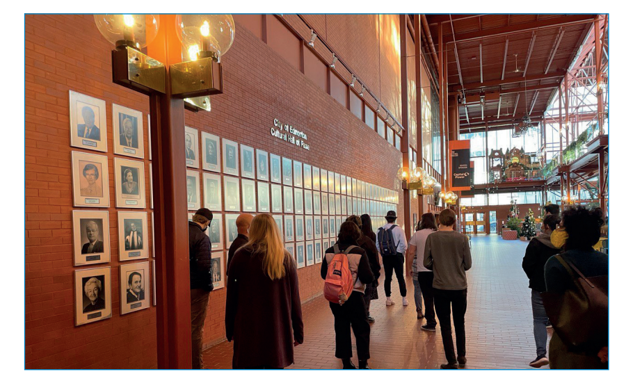
FIG. 1. MEDICINE HAT RED BRICK USED IN THE CITADEL THEATRE, FEBRUARY 2022.

To trace this colour, I travelled 527 kilometres south from Edmonton to Medicine Hat to see the land that produces this rich red construction material. The questions I asked were: What do architectural materials do? Do they keep traces of the history of their making/makers? Can the story of their violence be carried through the years in the form of materials such