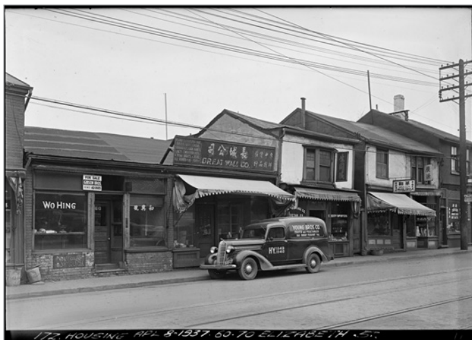
FIG. 2. THE WARD WAS THE HOST TO TORONTO'S FIRST CHINATOWN. | COURTESY OF THE CITY OF TORONTO ARCHIVES, 1937.