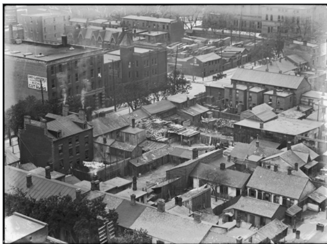
FIG. 3. TORONTO'S CITY CENTRE SHOWING A MIX OF INDUSTRIAL AND RESIDENTIAL ACTIVITY.

services for refugees. By 1920, the Ward also attracted artists, musicians, and political activists seeking central and affordable accommodation and permitted creative and unorthodox ways of life that were shunned in most of Toronto's middle-class neighbourhoods. Until the incremental demolition and gentrification that began in the 1930s, the Ward's bright pink, yellow, and blue painted facades containing bookstores, art galleries, cafés, and underground music venues were vital cultural markers in the development of Toronto's art scene. Despite cultural and lingual diversity, the Ward's citizens often gathered around common interests and demands, such as the right to housing and cultural self-expression and identity, as well as the desire for local representation and governance that would link them to the city's legal and political apparatuses. 14 Such bottom-up initiatives fomented the idea of the Ward as a vessel for artistic, political, and social change.