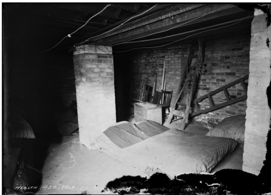
FIG. 7. DEPARTMENT OF HEALTH DEPICTING AN APARTMENT OF THE “FEEBLEMINDED,” 1916.

MacMurchy believed that before the housing problem could be solved, protocols had to be in effect to amend wayward, or merely different, individuals. 42 For her, these protocols focused on inculcating habits, by defining the habitus of the individual in the private home. 43 A home was more than a house in which to live, it was also a theatre of good ethics that was realized through the embodied practice of housework. She promoted housekeeping education to habituate and institutionalize a narrow standard of living informed by her Protestant Anglo-Saxon values. 44 She espoused that urban transformation happened from the inside out and that reform began with the individual in the single-family home, not the collective in the streets. MacMurchy published several booklets in the “Little Blue Books” series, circa 1920s, which aimed to educate women in the scientific management of domestic caretaking, childcare, and housecleaning, with titles such as How to Manage Housework in Canada , How to Make our Canadian Home , and How to Take Care of Household Waste . The series, targeted to women whom MacMurchy thought lacked knowledge of domestic hygiene, was translated into multiple languages, including indigenous Cree. These booklets aimed to instil into young mothers the colonially inherited ethics so that they could become—as she might have phrased it—“normal” Canadians. The various translations into multiple languages indicate that MacMurchy intended these manuals