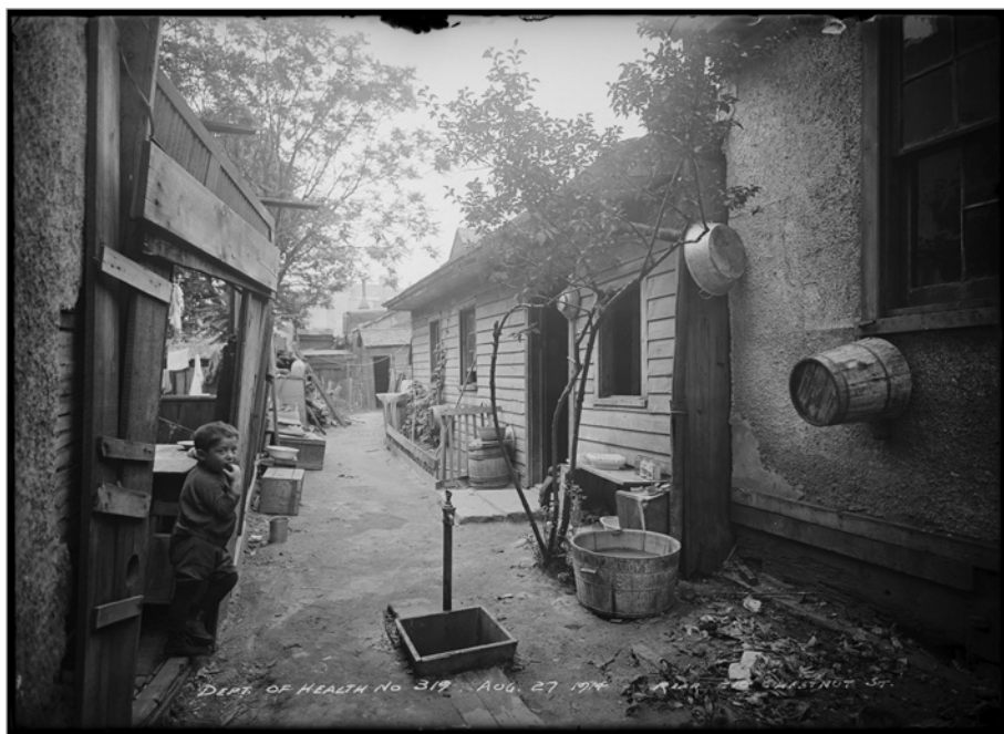
FIG. 8. PHOTOGRAPH DEPICTING AN INTERSTITIAL SPACE IN THE WARD THAT IS USED INFORMALLY BY THE NEIGHBOURHOOD AS A SPACE OF "COMMONS," 1914.