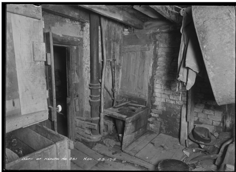
FIG. 4. ARTHUR GOSS PHOTO OF A "SLUM" INTERIOR, 1913. | COURTESY OF THE CITY OF TORONTO ARCHIVES.

lodgings around outdoor spaces presumably used for domestic activity (fig. 4). City council members and public health officials drew upon these photographs as impetus to target areas for reform. Goss's photographs also helped convince concerned citizens that urban poverty was proliferating in the centre of the city and lead to the public perception of the Ward as a "slum."