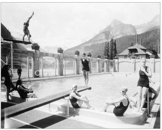
FIG. 5. CHÂTEAU LAKE LOUISE'S SWIMMING POOL, THE SECOND LARGEST POOL IN CANADA AT TIME OF CONSTRUCTION. INSTALLED IN 1926, PHOTO C. 1930. | CANADA DEPARTMENT OF INTERIOR, LIBRARY AND ARCHIVES CANADA, C-029447.

public cleanliness and rowdy conduct remained primary concerns. The second was associated with "swimming" facilities and health clubs, which were made available to the middle classes in the form of paid-admission pools like those at the YMCA. The latter sought to emulate the attitudes of the upper classes, who were, in turn, beginning to adopt the idea of pools as leisure spaces, with private pools being installed in the homes of the wealthy as early as 1895.<sup>23</sup>