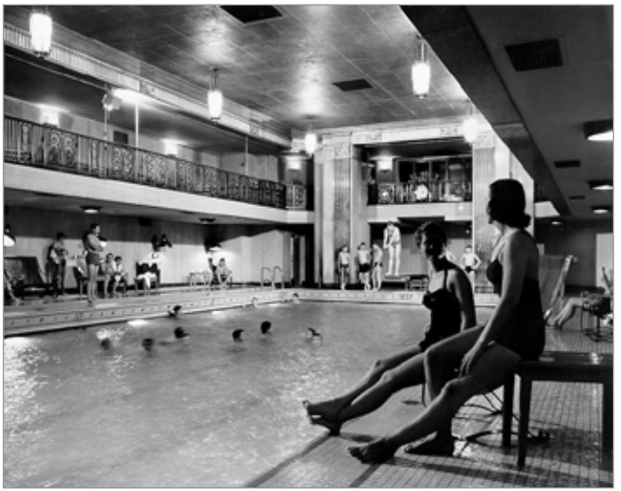
FIG. 13. CHÂTEAU LAURIER SWIMMING POOL, C. 1940. NOTE THE LOUNGE WINDOWS OVERLOOKING THE DIVING BOARD.

to a pair of swimming trunks, and the "Kellerman style" was gradually abbreviated to a skirtless, one- or two-piece outfit (fig. 11).<sup>48</sup> These revealing fashions inevitably heightened the sexual climate at swimming pools.<sup>49</sup> As bodies became publicly visible, the importance of physical appearance increased accordingly, and so a day at the pool became an exciting experience for voyeurs and exhibitionists alike.