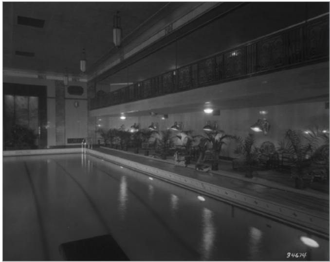
FIG. 12. CHÂTEAU LAURIER SWIMMING POOL, SHOWING THE PALM BEACH WITH SUNLAMPS, 1931. I CANADIAN NATIONAL RAILWAY COMPANY, LIBRARY AND ARCHIVES CANADA, PA-180766.