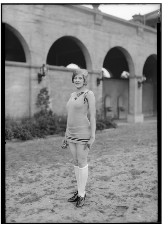
FIG. 11. BEAUTY CONTEST WINNER, 1926, WEARING A CONTEMPORARY SWIMMING SUIT.