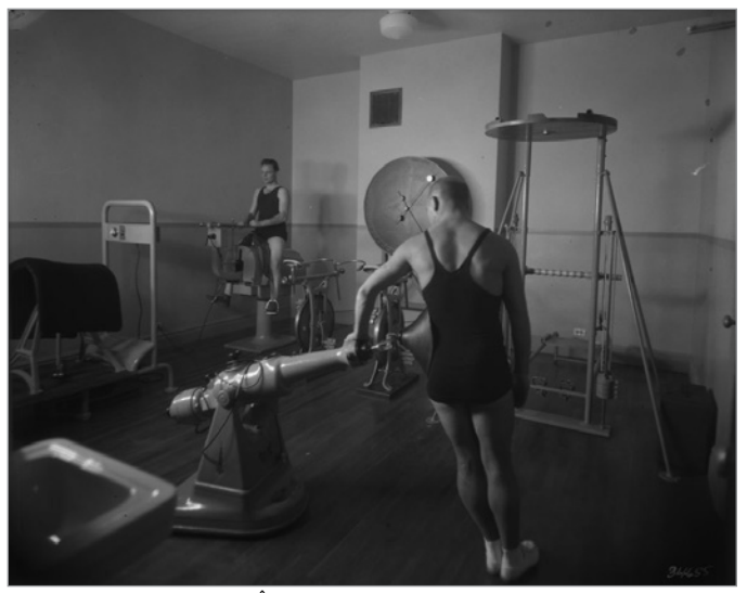
FIG. 8. THE GYMNASIUM IN CHÂTEAU LAURIER'S THERAPEUTIC DEPARTMENT, WITH PATIENTS USING THE ELECTRIC HORSE AND THE VIBRATIONS MACHINE, 1931.