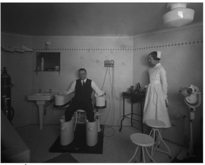
FIG. 9. CHÂTEAU LAURIER THERAPEUTIC DEPARTMENT'S SCHNEE BATH TREATMENT, 1931. | CANADIAN NATIONAL RAILWAY COMPANY, LIBRARY AND ARCHIVES CANADA, PA-175314.

end of the pool, a two-storey alcove held a decorative fountain, its lintel carved with waves. The fountain and alcove were executed in the same dark green marble as the pilasters, and were flanked on either side by ornate brass grates depicting stylized fish and shells. The second storey of the room featured a long, nearly wrap-around gallery decorated with an intricate, hand-wrought brass railing, and the tiled ceiling above was surrounded by a fluted white frieze adorned with carved marble panels. Other luxurious fittings included the original, brass, Art Deco lanterns, and the so-called "Angel's Stairway," a golden spiral staircase that connected the ladies changing rooms to the pool area.39