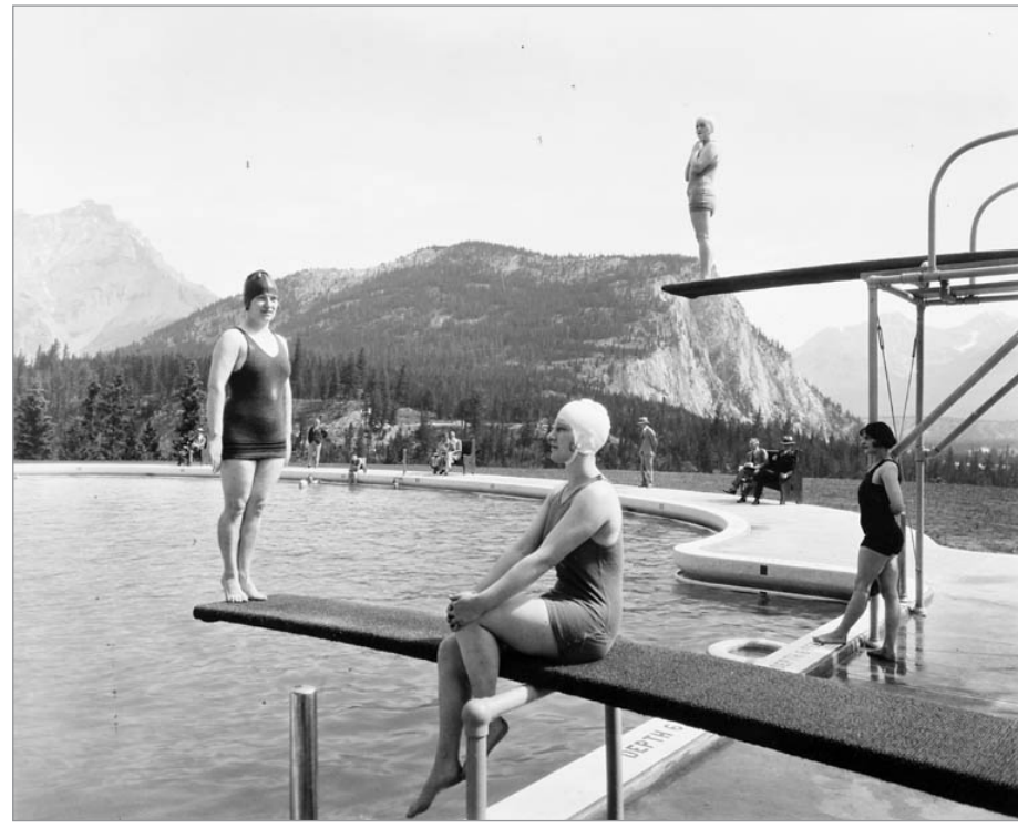
FIG. 14. SWIMMING POOL AT THE REMOTE BANFF SPRINGS HOTEL, C. 1930S. BUILT AMONG THE SPECTACULAR ROCKY MOUNTAINS, THIS WAS POSSIBLY THE FIRST GRAND HOTEL POOL IN CANADA.

As Wiltse reports of pools in the early twentieth century, "Swimming pools, for the most part, resisted commercialization. Entrepreneurs opened some for-profit pools during the interwar years, but they struggled to compete against the ubiquitous publicly owned pool, and many went out of business."58 This struggle may be reflected in the decision of the Canadian railway companies to add pools to only three more of their dozens of hotels. These were the Digby Pines Hotel in Nova Scotia, Château Montebello in Quebec, and the Château Laurier, all added in the years 1929 and 1930.59 Prior to this, only the two great Banff hotels (Banff Springs and Château Lake Louise) had undertaken such an improvement, and, perhaps tellingly, no other pool would be installed in any of the Canadian Grand Hotels until 1972. Indeed, most of the world's