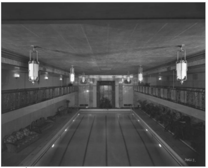
FIG. 7. CHÂTEAU LAURIER'S SWIMMING POOL, 1931. CANADIAN NATIONAL RAILWAY COMPANY, LIBRARY AND ARCHIVES CANADA, PA-175313.

and modern design.29 Under the traditional châteauesque exterior of Archibald and Schofield's new wing could be found an eclectic array of historic and modern architectural styles. As well as a formal Adam style dining room, the hotel opened the Jasper Tea Room—a restaurant decorated in stylized Canadian and aboriginal themes which "quickly became the favourite meeting place for Ottawa's young people."30 Château Laurier was shifting from the era of formal Louis XVI drawing rooms to the young and fashionable roaring twenties. Indeed, with the opening of the new addition, the hotel would see the signatures of film stars like Marlene Dietrich, Nelson Eddy, and Bette Davis added to its register.31