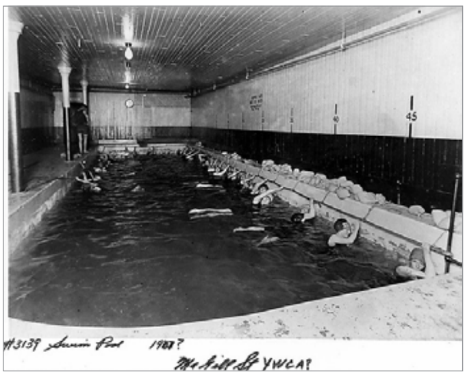
FIG. 4. WOMEN'S SWIMMING LESSONS, POSSIBLY AT THE MCGILL STREET YWCA IN TORONTO, C. 1907.