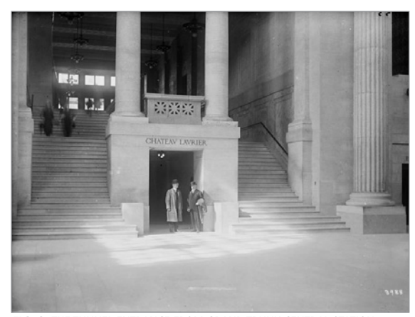
FIG. 2. THE TUNNEL ENTRANCE FROM GRAND TRUNK CENTRAL STATION TO CHÂTEAU LAURIER, 1916.