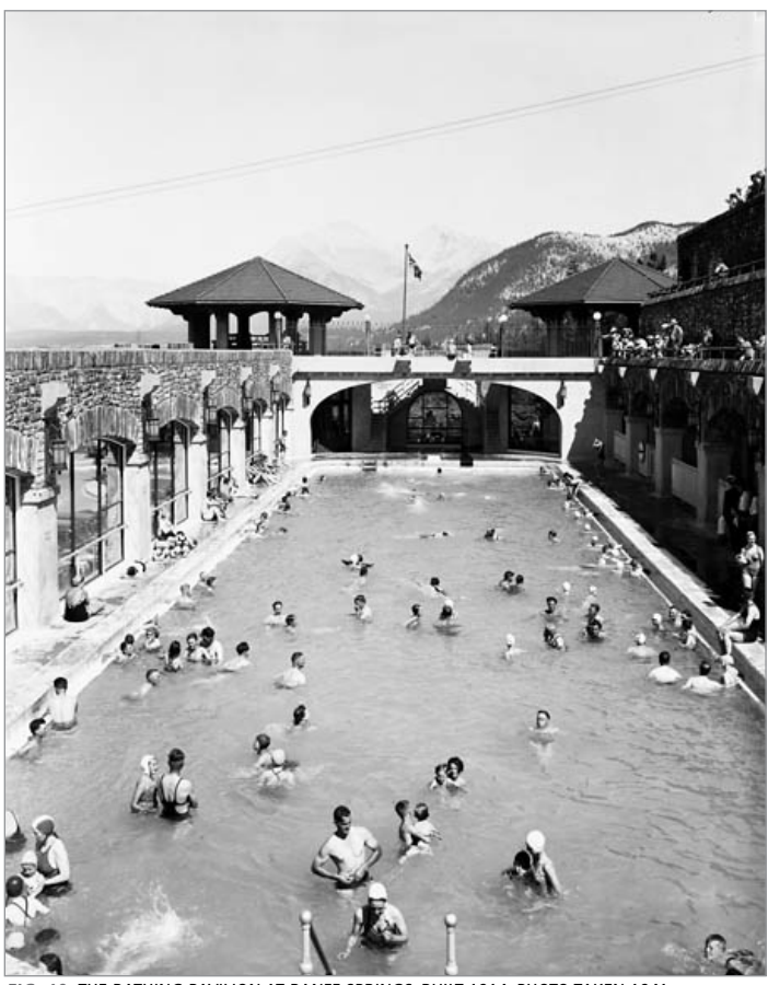
FIG. 10. THE BATHING PAVILION AT BANFF SPRINGS, BUILT 1914, PHOTO TAKEN 1941, FEATURING A THREE-TIERED SPECTATORS' BALCONY.