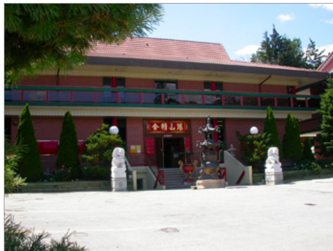
FIG. 8. THE BUDDHIST ASSOCIATION OF CANADA'S CHAM SHAN TEMPLE, 7254 BAYVIEW AVE., THORNHILL, ON. | BUDDHIST ASSOCIATION OF CANADA CHAM SHAN TEMPLE: [HTTP://EN.CHAMSHANTEMPLE.ORG/MESSAGES/ABOUTUS/INDEX.PHP?CHANNELID=8&SECTIONID=109&ITEMID=87&ATTACHID=0&LANGCD=EN], ACCESSED APRIL 5, 2021.