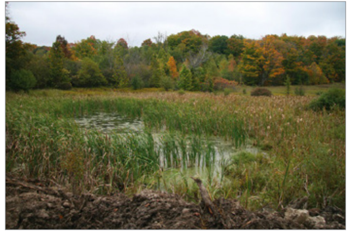
FIG. 27. BEFORE EXCAVATION, WOODLAND AND WETLAND AT THE WUTAI SHAN BUDDHIST GARDEN, 708 SKI HILL ROAD, BETHANY, ON.

Literally meaning “clear, cool mountain,” qingliang became an alternative name for the peak, following the Avatamsaka sutra , which associates the term with the earthly abode of Mañjuśrī. 81 Both the Mañjuśrī Hall and the Guanyin Hall, however, will be erected directly to the south of the main Dharma Hall. With indoor areas between five thousand and seven thousand square feet, these structures function as initiatory spaces through which devotees and other visitors may pass as they ascend northward to the main Dharma Hall. Interestingly, the alignment of these three halls does not mirror the placement of buildings at the Foguang Temple complex. Most Chinese temples are oriented on a north–south axis. The Great East Hall, however, faces west: thus positioned, it does not turn its back on the mountain abodes of the revered Mañjuśrī that rise in the north, south, and east (fig. 26). By contrast, the topography of the Wutai Shan Buddhist Garden site and surrounding lands permits the main Dharma Hall, the Mañjuśrī Hall, and the Guanyin Hall to be aligned north to south without incurring inauspicious connotations.