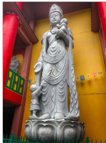
FIG. 15. COMPLEMENTING THE BUDDHIST ASSOCIATION OF CANADA'S TEN THOUSAND BUDDHAS SARIRA [RELICS] STUPA, THE GUAN YIN PAVILION HOUSES THE BODHISATTVA AVALOKITEŚVARA IN EPNOMYOUS FEMALE FORM, 4303 RIVER ROAD, NIAGARA FALLS, ON.