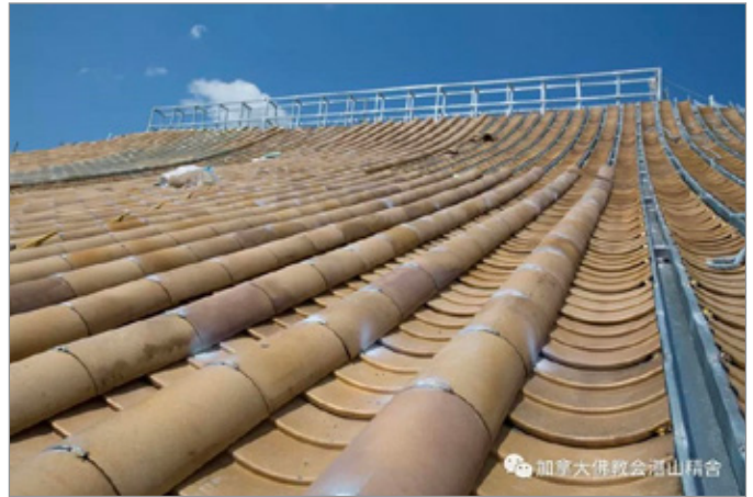
FIG. 23. COPPER TILES COVER THE ROOF THE MAIN DARMA HALL AT THE WUTAI SHAN BUDDHIST GARDEN, 708 SKI HILL ROAD, BETHANY, ON.