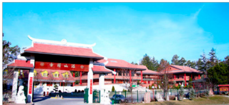
FIG. 10. THE BUDDHIST ASSOCIATION OF CANADA'S CHAM SHAN TEMPLE COMPLEX, 7254 BAYVIEW AVE., THORNHILL, ON. | BUDDHIST ASSOCIATION OF CANADA CHAM SHAN TEMPLE: [HTTP://EN.CHAMSHANTEMPLE.ORG/MESSAGES/ABOUTUS/INDEX.PHP?CHANNELID=8&SECTIONID=117&LANGCD=EN&ITEMID=87], ACCESSED APRIL 5, 2021.