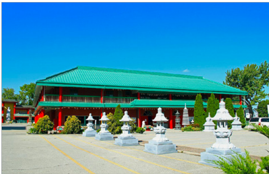
FIG. 14. ADJACENT TO THE BUDDHIST ASSOCIATION OF CANADA'S TEN THOUSAND BUDDHAS SARIRA [RELICS] STUPA, THE CONTRASTING HALL OF FIVE CONTEMPLATIONS TEMPLE, 4303 RIVER ROAD, NIAGARA FALLS, ON.

metres tall and weighing seven tons, which was fashioned in China, shipped to Canada in pieces and reassembled on site. A more modest two-storey building, the Hall of Five Contemplations Temple contrasts markedly with the stūpa (fig. 14). Painted in bright red, yellow, and green, the structure includes a worship hall, rooms for meditation and meetings, offices, a gift shop, a vegetarian restaurant and kitchen, a museum, and a library. The second floor provides accommodation for monks and nuns. Statues and paintings of bodhisattvas and Buddhist worthies may be found throughout the building. Also painted red, yellow, and green, the Guan Yin Pavilion features a gracious figure of the bodhisattva Avalokiteśvara in eponymous female form, posed upon a lotus flower pedestal as the patroness of mothers and the protectress of babies and infants (fig. 15).