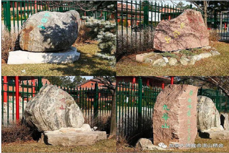
FIG. 16. INSCRIBED WITH THE NAMES OF THE BODHISATTVAS AVALOKITEŚVARA, MAÑJUŚRĪ, SAMANTABHADRA, AND KṢITIGARBHA, FOUR BOULDERS STAND OUTSIDE THE GATE OF THE BUDDHIST ASSOCIATION OF CANADA'S CHAM SHAN TEMPLE, 7254 BAYVIEW AVE. THORNHILL, ON.

monks had the rocks inscribed with the names of four bodhisattvas . These inscriptions reflect their understanding of the BAC's mission to practice and promote the compassion of the bodhisattva Avalokiteśvara, the wisdom of the bodhisattva Mañjuśrī, the conduct of the bodhisattva Samantabhadra, and the resolve of the bodhisattva Kṣitigarbha. In that regard, Chinese Buddhist tradition holds that these four bodhisattvas make their homes at four sacred mountains: Mañjuśrī at Wutai Shan, or the Mountain of Five Plateaus; Avalokiteśvara at Putuo Shan, or the Mountain of Brilliance; Kṣitigarbha at Jiuhua Shan, or the Mountain of Nine Glories; and Samantabhadra at Emei Shan, or the Mountain of the Delicate Brows. Located at a distance from one another, the four mountains symbolically encompass the cardinal geography of China: Emei Shan is located in Sichuan province in the west; Putuo Shan in Zhejiang province in the east; Wutai Shan in Shanxi province in the north; and Jiuhua Shan in Anhui province,