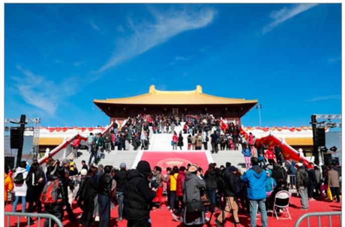
FIG. 25. ON OCTOBER 5, 2019, A CONSECRATION CEREMONY FORMALLY SANCTIFIED THE MAIN DARMA HALL AT THE WUTAI SHAN BUDDHIST GARDEN, 708 SKI HILL ROAD, BETHANY, ON.

and decorated, a consecration ceremony formally sanctified the main Dharma Hall on October 5, 2019 (figs. 24 and 25).