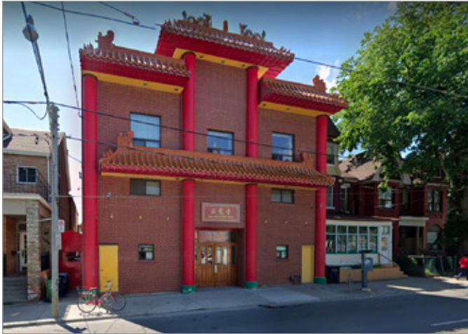
FIG. 5. THE CHINESE MAHAYANA PURE LAND BUDDHIST CHING KWOK TEMPLE (1992), 300 BATHURST STREET, TORONTO, ON. | GOOGLE MAPS: [HTTPS://WWW.GOOGLE.COM/MAPS/@43.6507928,-79.4053877,3A,90Y,269.14H,89.05T/DATA=!3M7!1E1!3M5!1SY5GGYBCTNSVSZ-CSF5Q80A!2E0!5S20180701T000000!7!16384!8!18192], ACCESSED AUGUST 24, 2021.