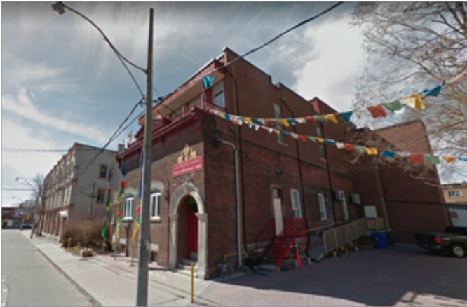
FIG. 3. THE RIWOCHÉ TIBETAN BUDDHIST TEMPLE, 28 HEINTZMAN AVENUE, TORONTO, ON.