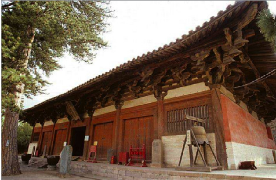
FIG. 17. A VIEW OF THE GREAT EAST HALL OF THE FOGUANG TEMPLE IN SHANXI PROVINCE, CHINA.

ponds, and other landscaping, as well as statues of bodhisattvas , various Buddhist worthies, and stone carvings of auspicious fauna. Da Yi and the BAC have received support from both the Canadian and Chinese governments, as well as generous donations from Buddhist communities in Canada and overseas.