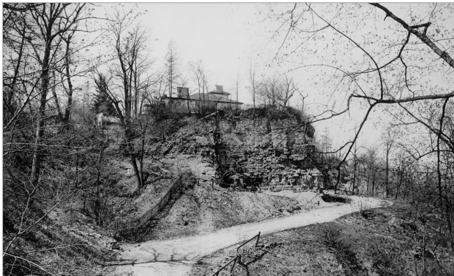
FIG. 7. BARTON LODGE VIEWED FROM BECKETT DRIVE, C. 1899.

the edge that little room was left for a drive. Wetherell therefore reversed Bardwell's siting so that the Lodge faced away from the town and fronted instead onto a park, while the back and side overlooked Hamilton and Lake Ontario. A photograph from 1899 shows just how close the rear open terrace was to the edge of the escarpment (fig. 7).