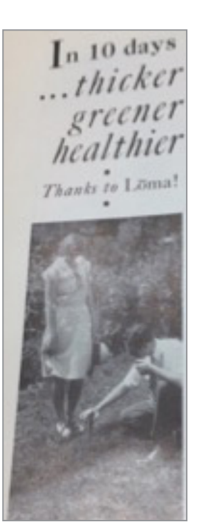
FIG. 12. LOMA ADVERTISEMENT, MAY 1931, P.100 | CANADIAN HOMES & GARDENS

EVINRUDE - EL FIG. 11. LAWN-BOY POWER MOWER ADVERTISEMENT, MAY 1934, P.66 CANADIAN HOMES & GARDENS over nature," and the upholding of resi-