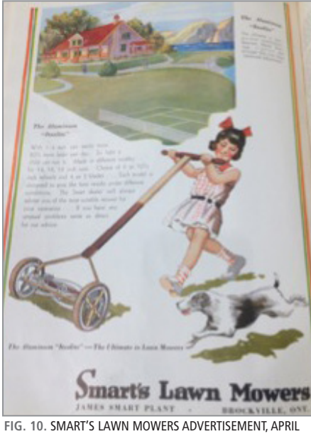
1932, P.54 | CANADIAN HOMES & GARDENS

assuring privacy by physically demarcating boundaries, yet maintaining visibility since their materiality ensures that they can still be seen through.