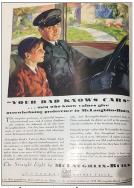
FIG. 2. "YOUR DAD KNOWS CARS," INSIDE COVER, AUGUST 1931 | CANADIAN HOMES & GARDENS

The association of nuclear family units with ideal domestic Canadian life, and thus upon lawns, was also reified in Canadian Homes & Gardens. Illustrations of smiling nuclear families proliferate throughout the magazine. A 1931 McLaughlin-Buick advertisement illustrates a smiling uniformed chauffeur telling a child "your dad knows cars" as the two sit in the driver's seat of an automobile. Behind them, visible from the car window, is the door of a house at the end of a pathway through a green front lawn, suggesting a scene of domesticity from which the child hails-one clearly coded by class status, considering the presence of an employed driver (fig. 2). This advertisement seems to be targeted toward a male automobile buyer-one who could attain a certain appropriately masculine knowledge of vehicles by making rational consumer decisions. It would thus be this man's landscaped front yard that appears in the background, another signifier of idealized class status and domestic propriety. Additionally, advertisements for food, though rare in the magazine, usually depict familial scenes as well: a 1935 advertisement for Chateau Cheese shows a white nuclear family picnicking atop some grass. This image associates their location with adventure and leisure by its suggestion that families take the cheese on "motor trips" or "fishing jaunts."18 Grass, here, provides an association with fitness and health, and is the backdrop for a scene of family togetherness. In a 1932