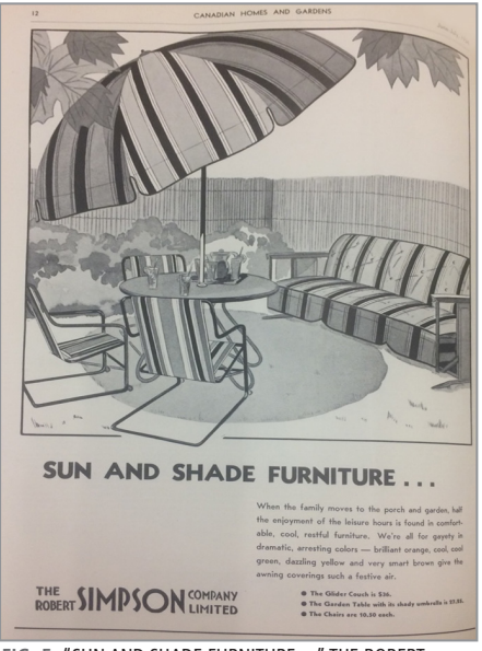
FIG. 5. "SUN AND SHADE FURNITURE..." THE ROBERT SIMPSON COMPANY LIMITED, JUNE-JULY 1934, P.12 | CANADIAN HOMES & GARDENS

authored by women and often referred to their readers as "ladies" or "mothers."<sup>40</sup> By moving the setting for the gendered labour of hospitality and homemaking out of doors, the space of the lawn was made into women's domain along with the kitchen and the dining room.