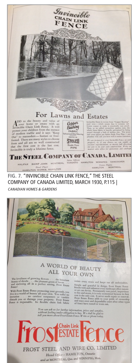
FIG. 9. FROST FENCE ADVERTISEMENT, MAY 1930, P.77 | CANADIAN HOMES & GARDENS

property, manifested by fencing one's yard and confining a lawn to the use of a single-family unit. While lawns, especially front lawns, functioned at least in part as a display of wealth, labour and taste, fences ensured that the public audience