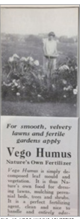
FIG. 13. VEGO HUMUS ADVERTISE-MENT, JUNE 1926, P.90 | CANADIAN HOMES & GARDENS