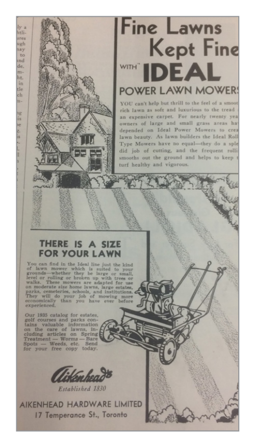
FIG. 6. IDEAL POWER LAWN MOWERS ADVERTISEMENT, MAY 1935, P. 77 | CANADIAN HOMES & GARDENS

Much of the language invoked around suburban gardens aligned the lawn with the interior of the house. Alessandra Ponte notes that gardens, and thus the lawns that covered their "floor," were often described "in terms of interior decoration" for women audiences.41 Lawns had been described using metaphors of rugs, carpets, or velvet long before the 1920s. However, famed nineteenth-century landscapers such as A.J. Downing and Charles Bridgman frequently invoked the imagery of carpets when suggesting that grass should keep a neat and regular appearance, and Henry Cleaveland, writing on domestic maintenance in 1856, suggested that "a carpet before your house" "will infinitely outlive any you can spread within."42