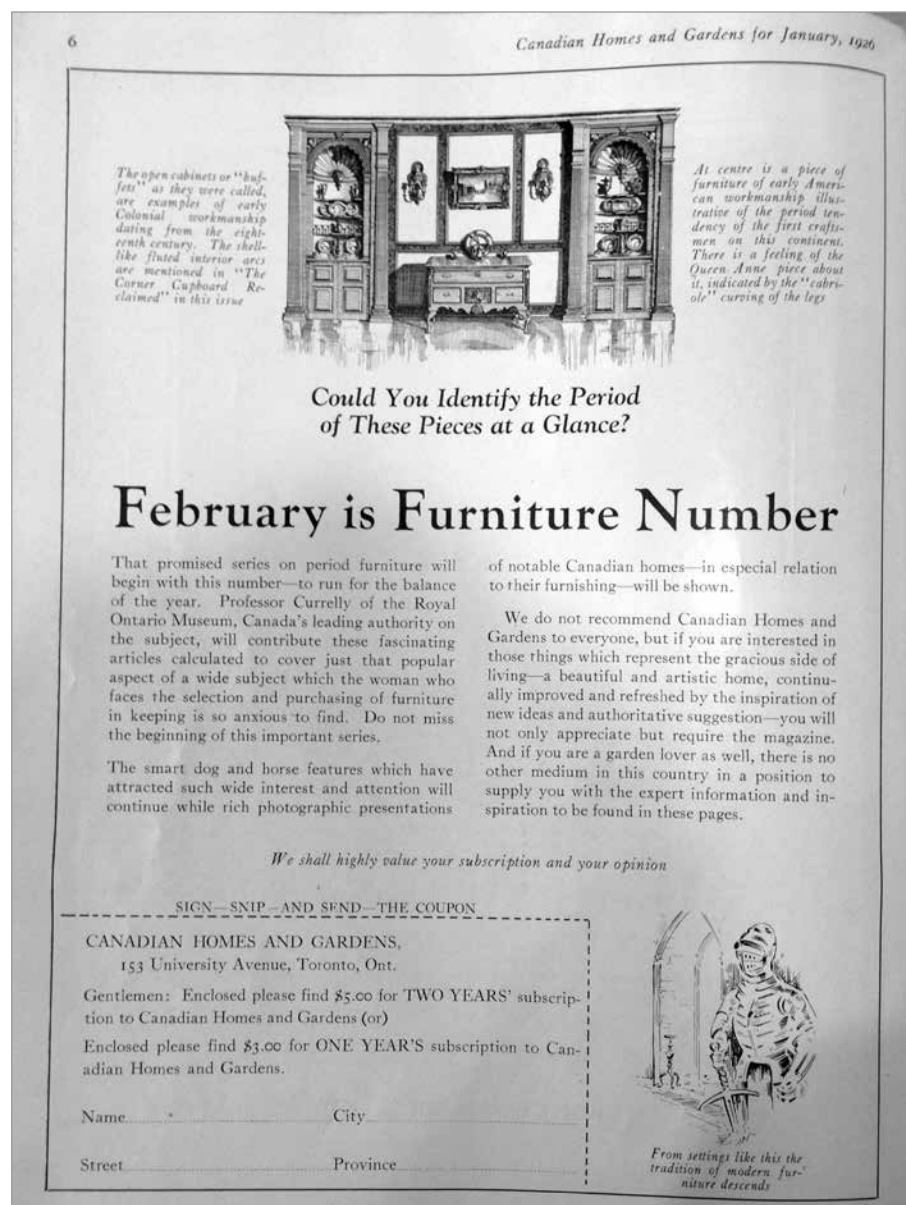
FIG. 2. ADVERTISEMENT FOR SUBSCRIPTION TO CANADIAN HOMES AND GARDENS MAGAZINE. | CANADIAN HOMES AND GARDENS , JANUARY 1926, P. 6.