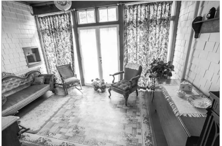
FIG. 14. THE SUN PARLOUR IN THE WYATT HISTORIC HOUSE MUSEUM.