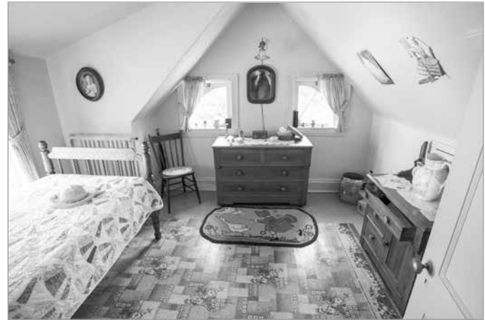
FIG. 13. THE "HIRED GIRL'S ROOM" IN THE WYATT HISTORIC HOUSE MUSEUM.