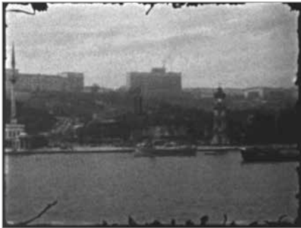
FIG. 9. HILTON HOTEL SEEN FROM THE BOAT. STILL FROM HOME MOVIE.