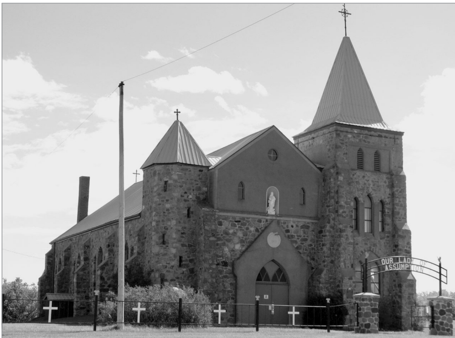
FIG. 1. VIEW OF THE NORTH SIDE OF KAPOSVAR ROMAN CATHOLIC CHURCH, KAPOSVAR, RM 183, SK (1906-1907). UNKNOWN ARCHITECT, PIROT STONEMASONS.

However, there are disadvantages to these macro-themed approaches as well. In an architect-centred approach, the tendency is to focus on the common elements of the architect’s motivations across the various structures, at the expense of the motivations of more disparate groups. While this disadvantage may not seem to be initially significant, it can be extremely important when the larger picture is considered. In the case