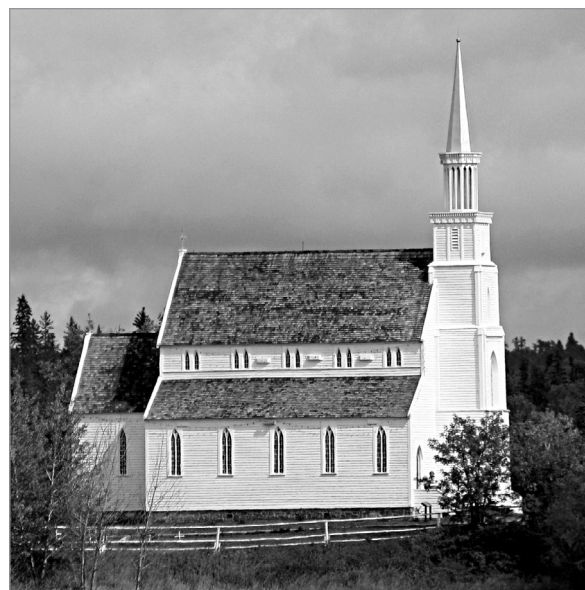
FIG. 8. VIEW OF THE SOUTH SIDE OF HOLY TRINITY ANGLICAN CHURCH, STANLEY MISSION, SK (1854-1860). UNKNOWN ARCHITECT.