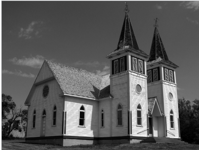
FIG. 2. VIEW OF THE WEST FAÇADE OF BEKEVAR PRESBYTERIAN CHURCH, BEKEVAR, RM 94, SK (1912). UNKNOWN ARCHITECT. | KRISTIE DUBÉ.

of late nineteenth- and early twentieth-century Canadian religious architecture, favouring a denominational theme results in a focus on the motivations of the French- or English-speaking clergy. While useful in understanding the larger movements of complex religious organizations during a dynamic period, this approach can also result in the perpetuation of an Anglo/French-normative perspective, at the expense of the minority immigrant narratives of the congregations. This consequence is particularly possible with Saskatchewan's early built heritage due to the often disparate motivations of the English/French clergy and the ethnic minority congregations. Consequently, I propose an alternative perspective, one that uses a micro-history approach, in order to rediscover these minority immigrant stories. In the interest of demonstrating the extent of the immigrant narratives that can be uncovered, I will here re-examine two structures that I have already explored in the traditional denominational/architect-driven approach, Kaposvar Roman Catholic Church ([Rural Municipality] RM 183, 1906-1907, fig. 1) and Bekevar Presbyterian/Reformed Church (RM 94,