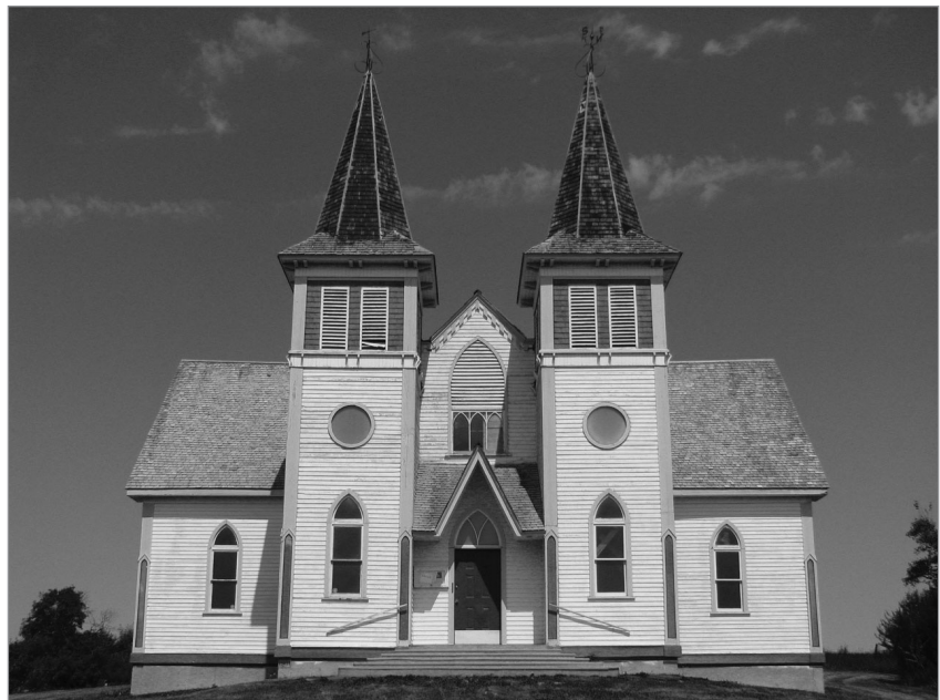
FIG. 10. VIEW OF THE WEST FAÇADE OF BEKEVAR PRESBYTERIAN CHURCH, BEKEVAR, RM 94, SK (1912). UNKNOWN ARCHITECT.

somewhat temporary. 24 It is therefore unusual to have overly large wooden churches in Saskatchewan, though there are some notable exceptions, such as Holy Trinity Anglican Church at Stanley Mission (1854-1860, fig. 8). However, Bekevar's committee was looking to compete with Kaposvar, and so needed to create something that was similarly arresting. They chose to accomplish this feat by adopting the features of a great medieval church.