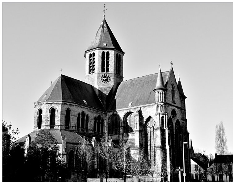
FIG. 7. VIEW OF SOUTH SIDE OF OUR LADY OF PAMELE, OUDENAARDE, BELGIUM (1234-1264).