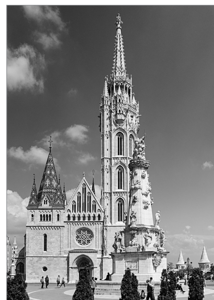
FIG. 4. VIEW OF THE WEST FAÇADE OF MATTHIAS CORONATION CHURCH, BUDAPEST, HUNGARY (14 TH CENTURY). | STEFAN SCHÄFER, LICH.

Evidence of the congregation’s involvement in the construction of the church is found in the particulars of the design of the façade, where links to the great churches of their native homeland are evident. The most likely source of inspiration was the great coronation Church of Our Lady (Matthias) in Budapest (fourteenth century, fig. 4). The general massing of the façade, with the northern tower being substantially lower than the southern one is quite similar, albeit simpler in design (figs. 1 and 4). It was common for churches to begin construction with the