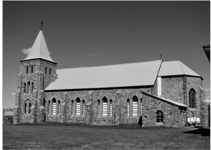
FIG. 6. VIEW OF THE SOUTH SIDE OF KAPOSVAR ROMAN CATHOLIC CHURCH, KAPOSVAR, RM 183, SK (1906-1907). UNKNOWN ARCHITECT, PIROT STONEMASONS.

narrative held within the façade showed unlimited ambition for the future of the congregation and the colony, one on par with the highest glories of their homeland.