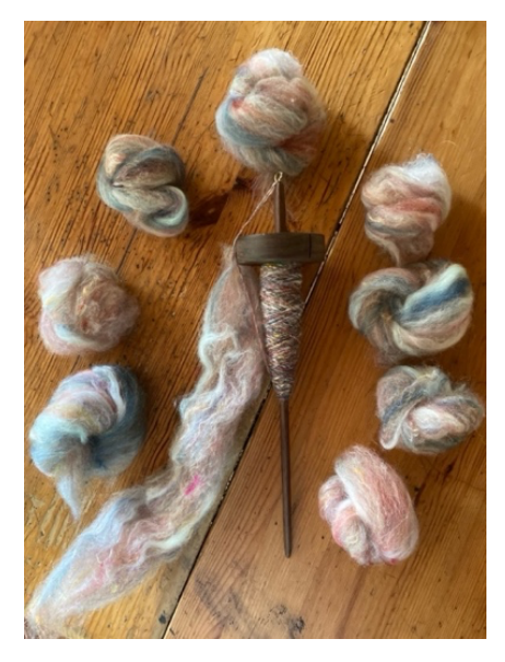
Figure 2. Wool for the Tapestry

I took this picture of fibre (that I had blended) ready to be spun into yarn. Looking at it again, I appreciate how the colours in the fibre are both varied and subdued, how their cloud-like forms are full-bodied but look light as air, and how the length of this cloud looks like it is transformed so easily into a compact thread. The cloud bundles form a circle like they have come together to gather, much as I imagine we have. We share many things in common, but we are each unique, stunning, and vital. (Whisper)