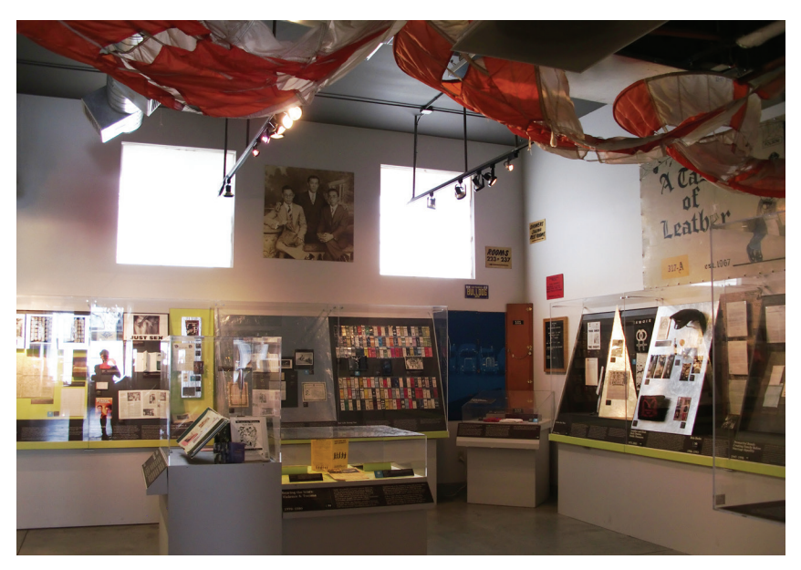
Figure 1: "Our Vast Queer Past" exhibit at the GLBT History Museum, 2014

pieces of clothing, sex toys, towels, or tarot cards. The objects housed in "grandma's attic," however, did not make their debut in the museum but were imbued with both the emotional character and the organization of their previous home in the GLBTHS Archives. After all, one of the primary goals of the museum was to showcase the varied items that resided in the archives, which are often only visited by researchers. Romesburg explains that "the museum was to showcase the archives' depth and breadth, attract new collections, engage the public with the importance of queer history and powerful exhibitions linking past and present."<sup>47</sup> In this way, the museum intended both to present the archival materials to the public as an education tool and to directly encourage monetary and archival donations that would benefit the archives.