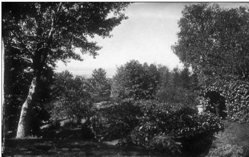
Bridge and arbour at Temple Grove, Côte-des-Neiges, 1872, by Henderson (MP 33.4)