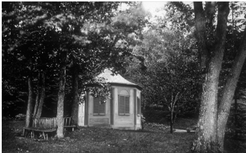
Summer house at Temple Grove, 1872, by Henderson (MP 33.5)