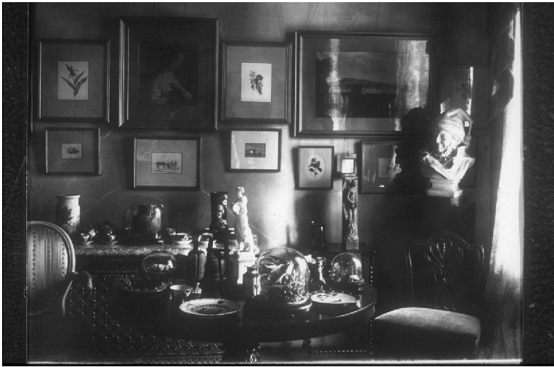
Artifacts and artwork inside Temple Grove, Montreal, ca 1916 (MP 2135.4)