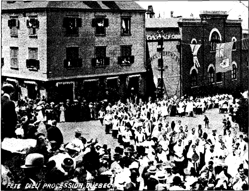
Corpus Christi procession in Quebec City (postcard), [ca 1908-1920].

was no regular, public celebration of the latter until the eve of the Rebellions of 1837. By contrast, the Fête-Dieu was celebrated each year, in each parish throughout the territory of what would eventually become Quebec. Participation was obligatory, according to church ritual that stretched back to the thirteenth century, when the Feast of Corpus Christi was added to the Catholic calendar on a date that could fall anytime from the end of May to the end of June, depending on the timing of Easter. 29