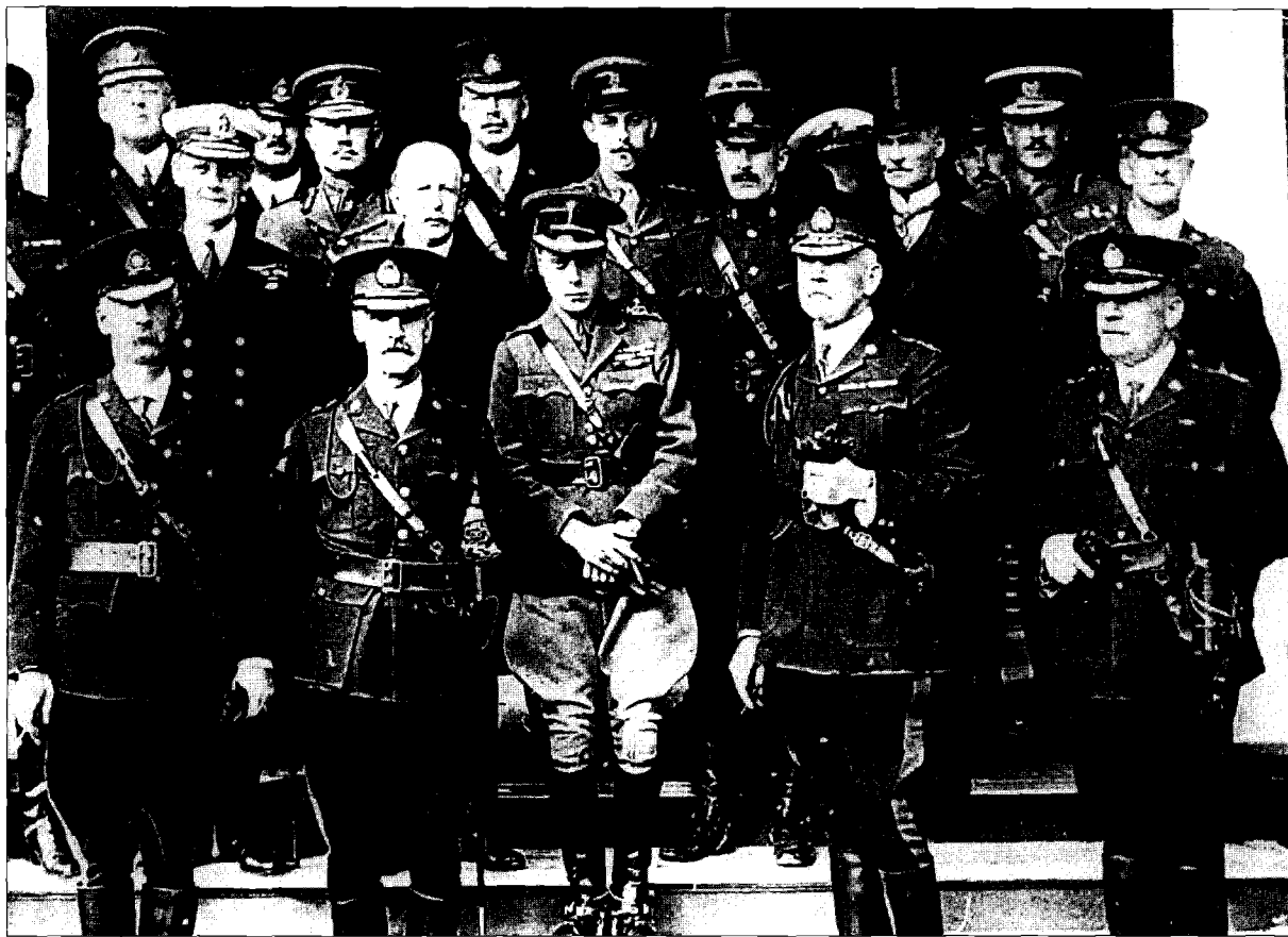
THE MASCULINE MOUNTIE