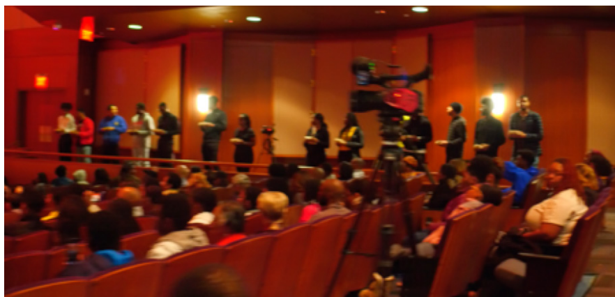
Figure 8: Africana Music Experience concert: general education students playing instruments they made ( top and bottom ); Morehouse Glee Club and Afro Pop Ensemble and guest artists ( centre ) all performing “Lithisikiya,” an anti-apartheid song in three indigenous languages of South Africa: Xhosa, Zulu, and Sotho.