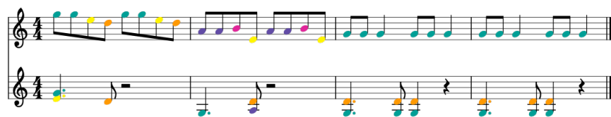
Figure 6. Ûbò-ákā (Ìgbò name for lamellaphone) duet, composed by Quintina Carter-Ènyi

A wide variety of performance activities, both ethnically specific and eclectic, may be engaged once the instrument has been tuned and, optionally, a pickup installed. Figure 6 is an example of a duet that Quintina composed for students based on Ìgbò melodic and rhythmic motives. This has been used consistently with general education students, many with no prior musical training.