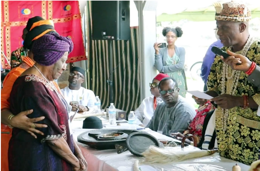
Figure 2. 2018 Ìgbò Reconnection Ceremony in Staunton, VA.

different in the twenty-first century than in the 1950s and 1960s when Pan-Africanism (Black solidarity) was so essential for African independence and civil rights movements. Identity formation around ethnic heritage for African Americans has been transformed through DNA testing. An example of this move to ethnic recognition is the annual Ìgbò Reconnection Ceremonies in Staunton, Virginia, and Chicago, in which DNA-tested African Americans are re-initiated into the Ìgbò ethnic group through a naming ceremony. The event is focused on people of Ìgbò descent and prioritizes their reconnection, but also welcomes people not of Ìgbò descent, and the 2018 ceremony welcomed a young white male to the Ìgbò community. Thus, even white people who want to associate with Africa are being more ethnically specific instead of pan-African. Focusing on understanding and appreciating a single ethnic group avoids essentialism.