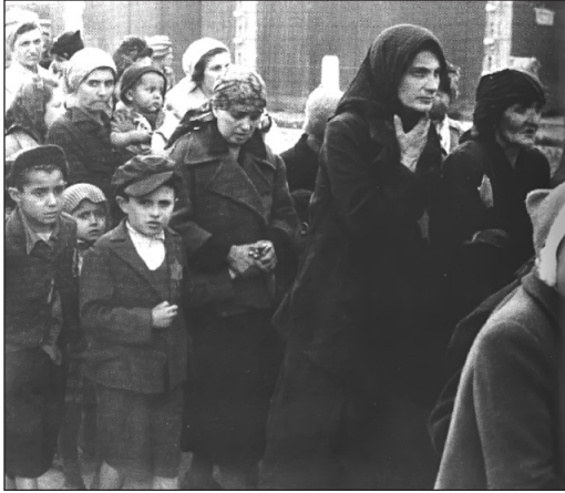
Figure 1. The woman to whom Shekhinah is dedicated (Rodal 1988)