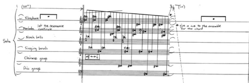
Figure 4. Cadenza figure from In Gottes Gärten schweigen die Engel , p. 22

I know that we all feel a certain kinship towards certain composers. Why is Brian's music so special to you? Is it Brian's music that attracted you or his quirkiness and humour towards music and life?