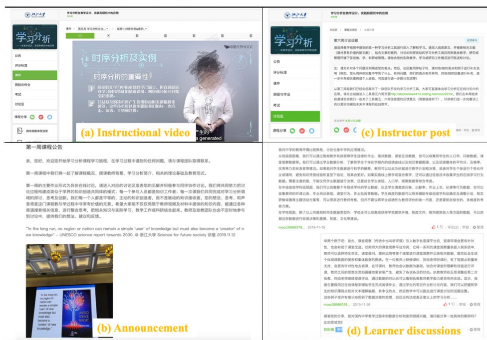
Figure 1. The MOOC platform.

We used a combination of pedagogical strategy, a learning analytics tool, and a social learning environment to foster learner engagement in discussions. First, we used a knowledge-construction pedagogical strategy and related prompts, such as sharing and comparing information, elaborating of opinions, exploring dissonance among ideas, negotiating meanings, and synthesizing knowledge (see Figure 1). Second, from a technological perspective, we designed and devised a student-facing learning analytics tool to demonstrate learners' discussion processes with the interaction, topic, and epistemic networks (see Figure 2). The interaction network demonstrated learners' social interactions with others; the topic network demonstrated learners' use of keywords; and the epistemic network demonstrated five dimensions (i.e., concept, procedure, fact, strategy, and belief) shown by the learners in their posts. This analytics tool was hosted as a Web page and embedded in the course discussion forum. Finally, we built a social learning environment through the use of social media and MOOC forum. We used the group function of a popular Chinese social media tool named WeChat to build a self-organized community through which learners could foster a sense of belonging (see Figure 3). We also designed a social section in the forum for learners to share personal life stories or interesting topics.