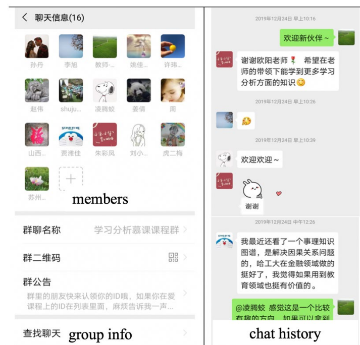
Figure 3. The WeChat group.

From “An Application of a Learning Analytics Tool in MOOC,” Fan Ouyang research team, n.d. ( https://8jrsl.coding-pages.com/ ). In the public domain.