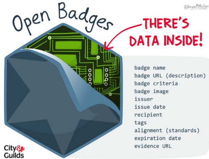
Figure 3. A visual representation of the kinds of data that can be included in an open badge. Adapted from “Open badges (P.S. there’s data inside..),” by Mathers, 2019 ( https://bryanmmathers.com/open-badges-data-inside/ ). Image is licensed CC-BY-ND.

Badge images. Although metadata often explains the significance of a given badge, the badge image is what gives the first impression. One study found the credibility of an entire program can be lowered by less aesthetically pleasing badge images (Dyjur & Lindstrom, 2017).