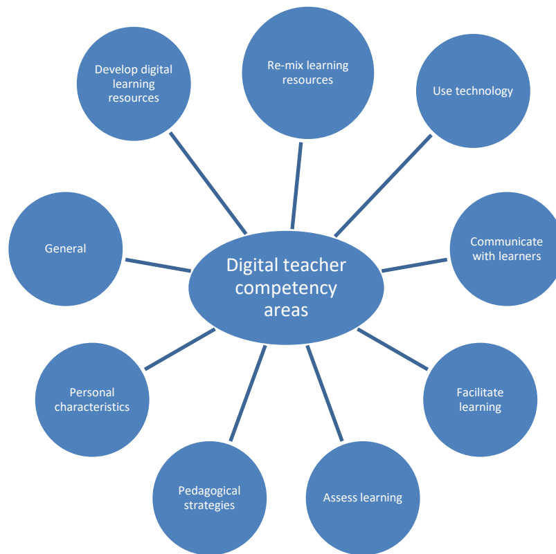
Figure 2. Major areas of responsibilities for the digital teacher of the future.