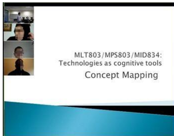
Figure 3. A screen capture of the instructor's computer.

Implementation. Three students attended this session at homes while the rest were in the classroom. Every online student successfully connected to the video conferencing room before the start of the lesson. As shown in Figure 3, their streaming videos were clearly displayed on the classroom projector. The instructor shared the PowerPoint slide with the online students using the tool Zoom. Both the online and classroom students could view the slide and the streaming videos. The instructional process was video recorded in Zoom and later uploaded to the course web site for the students to review.