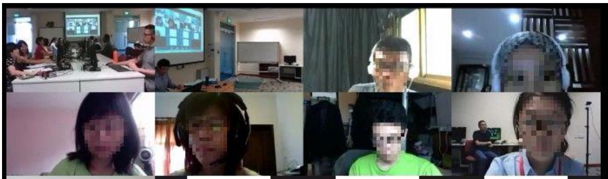
Figure 4. An illustration of the BSLE.

Implementation. Eight online students attended this session online. The instructor and most online students joined the video conferencing room before the lesson started. The instructor further reminded the online students to mute their mics. The student who complained about the sound problem attended this session from home again. He was happy with the improved quality of sound. Figure 4 shows what the BSLE looked like in this session.