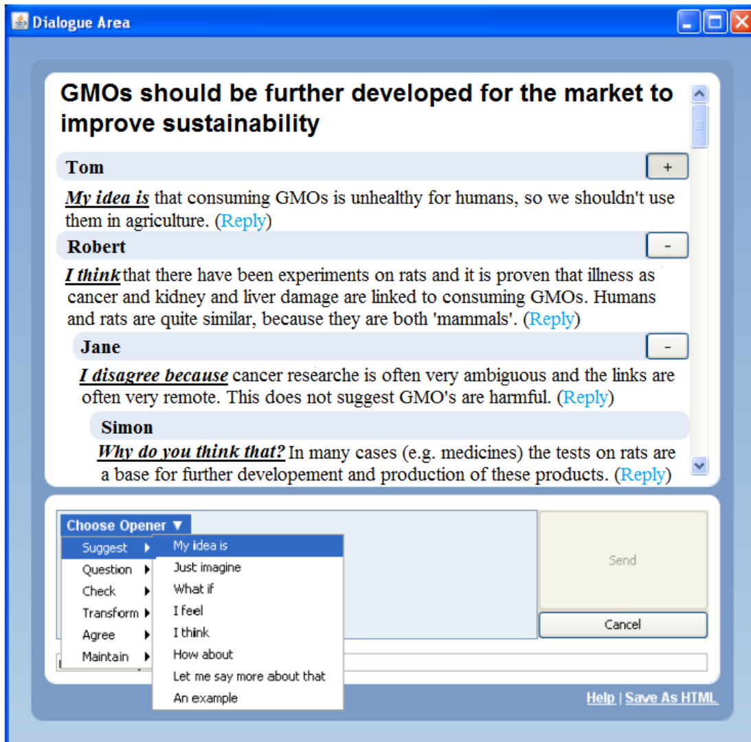
Figure 1. A screenshot of the digital dialogue game with associated sentence opener.

free discussion board (for example McAlister, Ravenscroft, & Scanlon, 2004; Ravenscroft, 2011; Ravenscroft & McAlister, 2006).