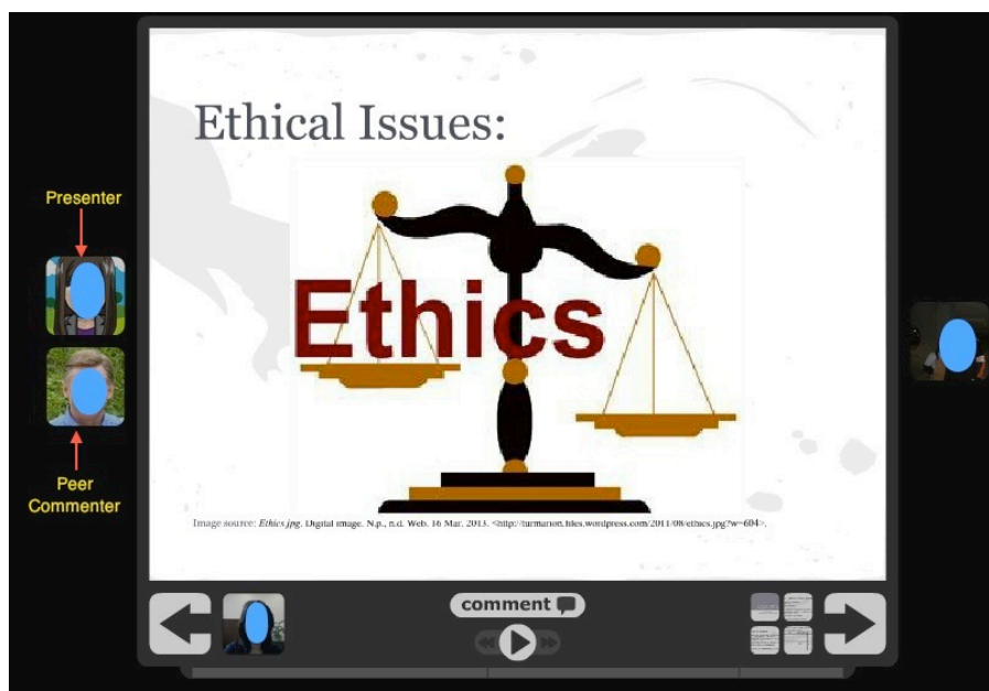
Figure 1. An example of role-playing peer feedback activity on VoiceThread.