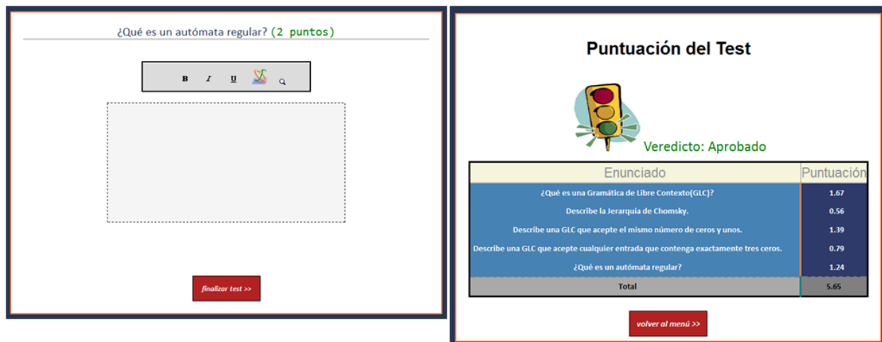
Figure 3. Question and text editor with MathEdit (a) and mark of the test once it is finished (b).

In order to evaluate themselves, students are shown a list of alphabetically ordered subjects in which they can realise the evaluation by choosing a subject and selecting the test they wish to start with and the difficulty level. The statement of each question is presented to the students together with their corresponding mark. The students must answer within a text editor, where they can insert formulas thanks to a JavaScript plug-in called MathEdit (Su et al., 2006), as seen in Figure 3a. Once the answer has been written and the test is finished, the system provides a score to the student together with the obtained marks in each of the questions (see Figure 3b). Likewise, the students can check, for each question, the answers they wrote as well as the reference questions written by the teacher.