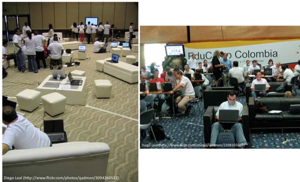
Figure 3. Examples of furniture and space.

The workshop included activities that created new opportunities for interaction among participants. An equally important aspect was the space in which these activities were carried out: an unstructured, disorganized space that, along with the furniture used, conveyed a clear and positive message about the nature of the activity developed throughout the day (see Figure 3). This aspect was the first un-structuring element, because the attendees came to a workshop on technology and discovered an informal and flexible environment, which was integral to the activities taking place. It is worth noting that the level of un-structure of the space depends largely on local conditions. (For a more detailed discussion on this topic, see Leal, 2010.)