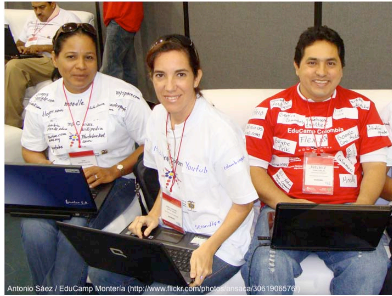
Figure 2. Participants with tags on their clothing.