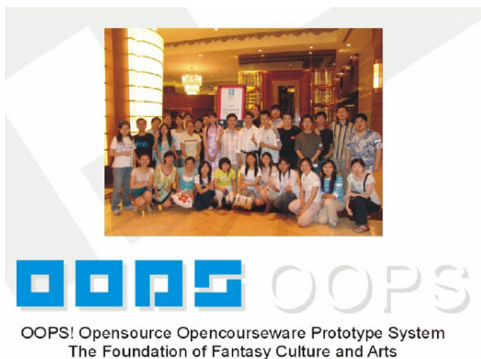
Figure 1. The Opensource OpenCourseware Prototype System (OOPS) volunteers