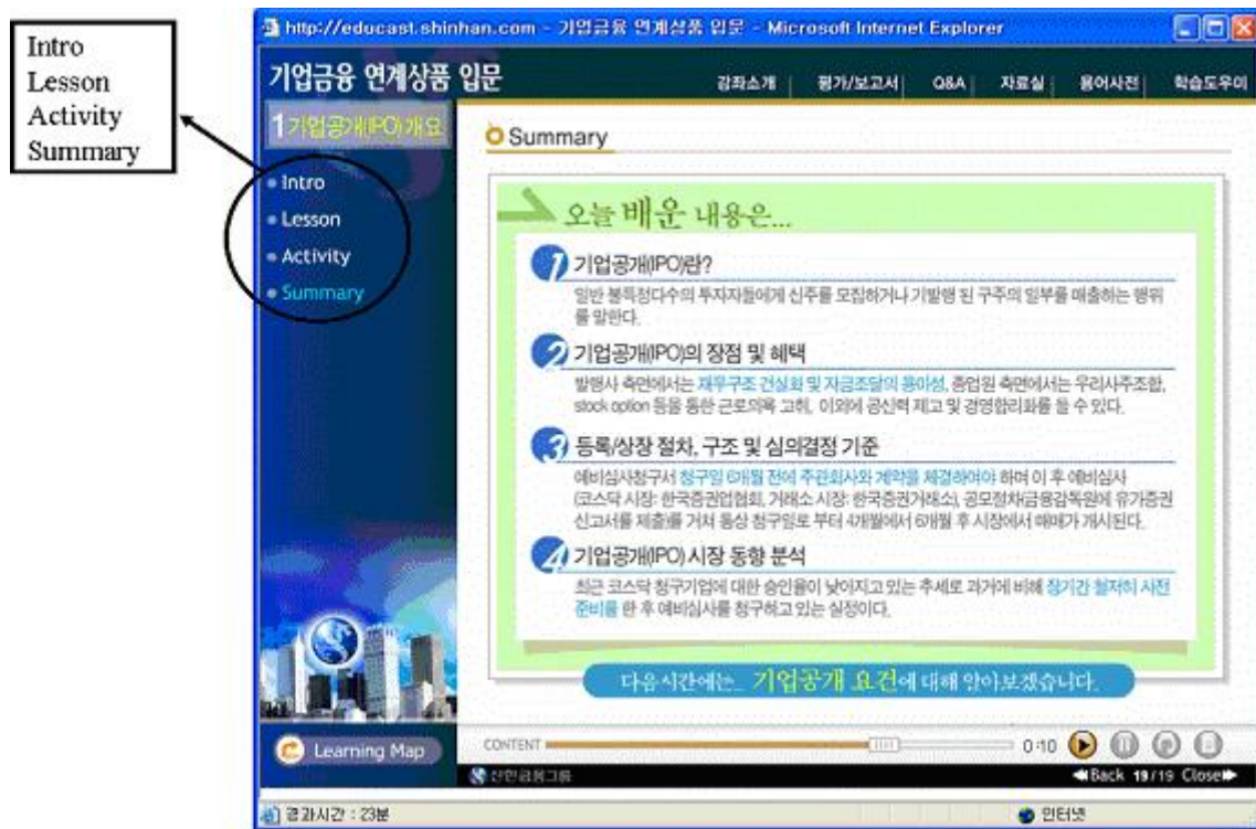
Figure 1. An Example of e-Learning: Tutorial type

Table 2 shows that nearly 90 percent of all e-Learning content in 2005 were tutorials in either HTML or Lecture-on-Demand (LOD) format. The remaining 10 percent were simulations that honed technical skills. As these two types – tutorials and simulations – became so ubiquitous over the past three years in the field of corporate e-Learning, the government’s Employment Insurance Fund eventually dropped support for other types of e-Learning programs.