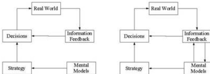
Figure 3a – Single loop learning Figure 3b – Double loop learning

An important and confounding aspect of real-world systems is delay. There is always some delay in receiving feedback, but the longer that delay, the harder it is to operate effectively in it. In an educational context, feedback delay could manifest itself in wide swings in policy; for example, administration might fund a DE program, then cut funding too soon after launch, only later to re-fund the program and try again. The inability of policy-makers to wait long enough to see the results of their machinations is the cause of many strange human system behaviors, such as real estate boom/ bust cycles, stock market fluctuations, and aircraft pilot over-correction and oscillation.