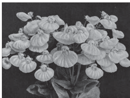
Fig. 1: Slipper Flower. Das Blumenwunder Souvenir Program (Private Collection).