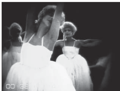
Fig. 7: Berlin Ballet Corps. Das Blumenwunder.

Here we should recall that during the Weimar period, Ausdruckstanz , also called “expressionist,” “interpretive,” “absolute” or “ecstatic” dance, was an experimental dance form which aimed to “project deeper levels of the human psyche,” 47 but also chart out the “ugliness” and distorted rhythms of modern life.