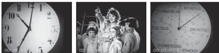
Fig. 4 a, b, c: Plant Temporality: “Let the clock race!” Das Blumenwunder.