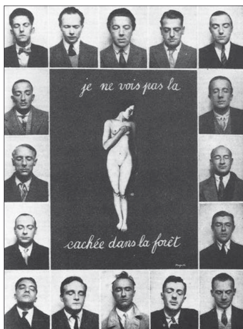
Fig. 3: Photomaton pictures of Breton's group around a painting by René Magritte, La révolution surréaliste 5/12, 1928, p. 73.

This is an ingenious example of picture policy, for not only is the dynamics between picture and text an attack on naïve humanism, but also simultaneously ridicules the self-promoting Surrealist circle surrounding Breton (which Bataille, Leiris, and several others from the Documents staff had left). Furthermore it mocks the Breton's relationship to the 19 th century and the dream. No names, no arguments, but simply a gesture of contempt, completely uninvolved: this is the strategy of this piece of picture policy. It conforms to the policy from issue to issue for a more assured concept of the journal. Documents infiltrates, experiments, and goes straight to the point.