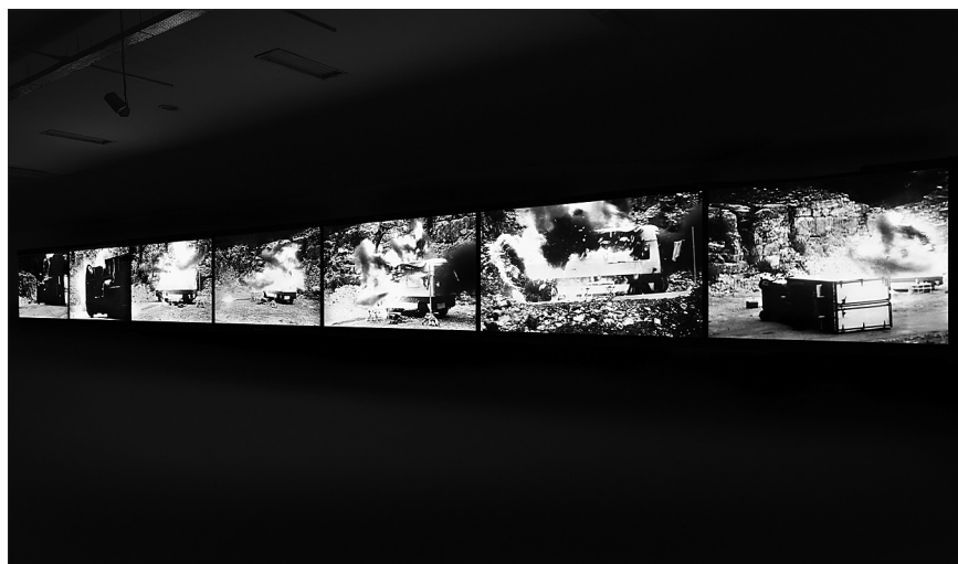
Fig. 1: Seven minutes before , 2004.

Melik Ohanian, Seven minutes before , 2004, 7 synchronized video projections, Beta Digital on DVD with DTS Sound, 28 speakers and 7 bass boxes, 7 × 21 min. 2800 × 1200 cm.