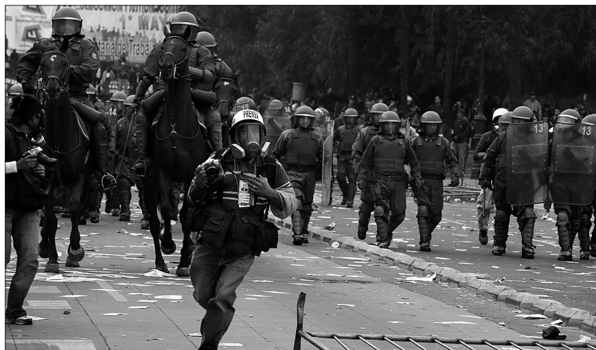
Fig. 3: Melik Ohanian, September 11, 1973 _ Santiago, Chile , 2007, HD video on DVD with ambient sound, 90 min.