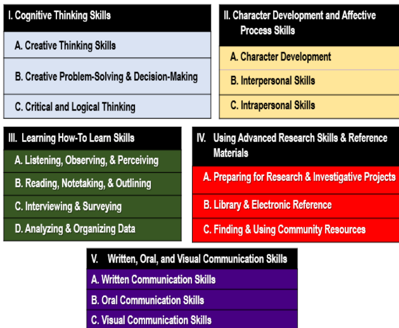
Figure 4: Taxonomy of cognitive and affective processes.

The goals of Type III enrichment include: