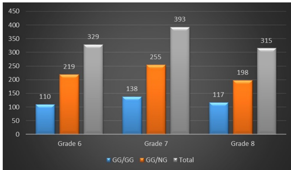
Figure 3: Prevalence by group and grade.

We investigated covert aggression experienced during 6 th , 7 th , and 8 th grades in GG/GG and GG/NG groups. Participants reported the most incidents during 7 th grade ( N = 393 ; 38%) in both GG/GG ( N = 138 ; 35%) and GG/NG ( N = 255 ; 65%) groups. Sixth grade ranked second ( N = 329 ; 32%) in the GG/GG ( N = 110 ; 33%) and GG/NG ( N = 219 ; 67%) groups. Eighth grade ( N = 315 ; 30%) showed the lowest prevalence in GG/GG ( N = 117 ; 37%) and GG/NG ( N = 198 ; 63%) groups. The prevalence of incidents showed consistency with more incidents reported in the GG/NG than GG/GG group in all three grades. Percentage differences between the GG/GG and GG/NG groups ranged from 30% to 34% and 26% in 6 th , 7 th , and 8 th grades, respectively (see Figure 3).