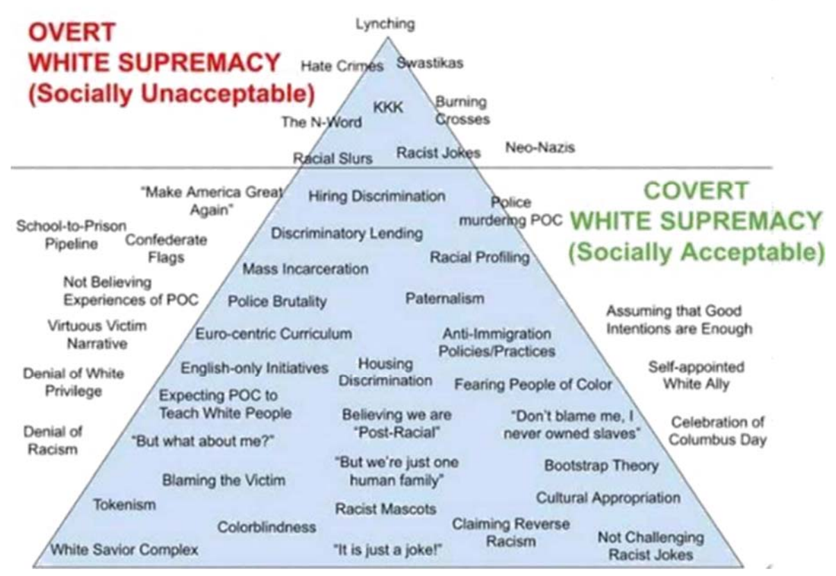
Note: Adapted from Safehouse Progressive Alliance for Nonviolence (2005) and Turner (2018).