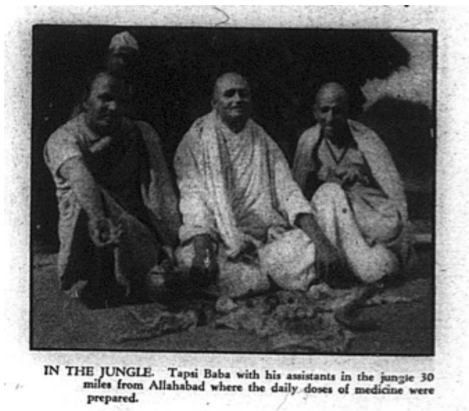
Figure 2: Tapasviji with his assistants for the Malaviya treatment as appeared in The Illustrated Weekly of India in Lal 1938.

Swami was primarily offering treatments in Colombo, Ceylon (Sri Lanka) which offered rejuvenation for more modest commitments of time and money than Malaviya's more famous example. However, the existing documents do not make it clear if Anandaswami was primarily an ascetic who later set himself up as a physician, or if he was first trained in Ayurveda, studied further rejuvenation techniques under Tapasviji, and then established his own business on the back of Malaviya's well-publicised success. 64