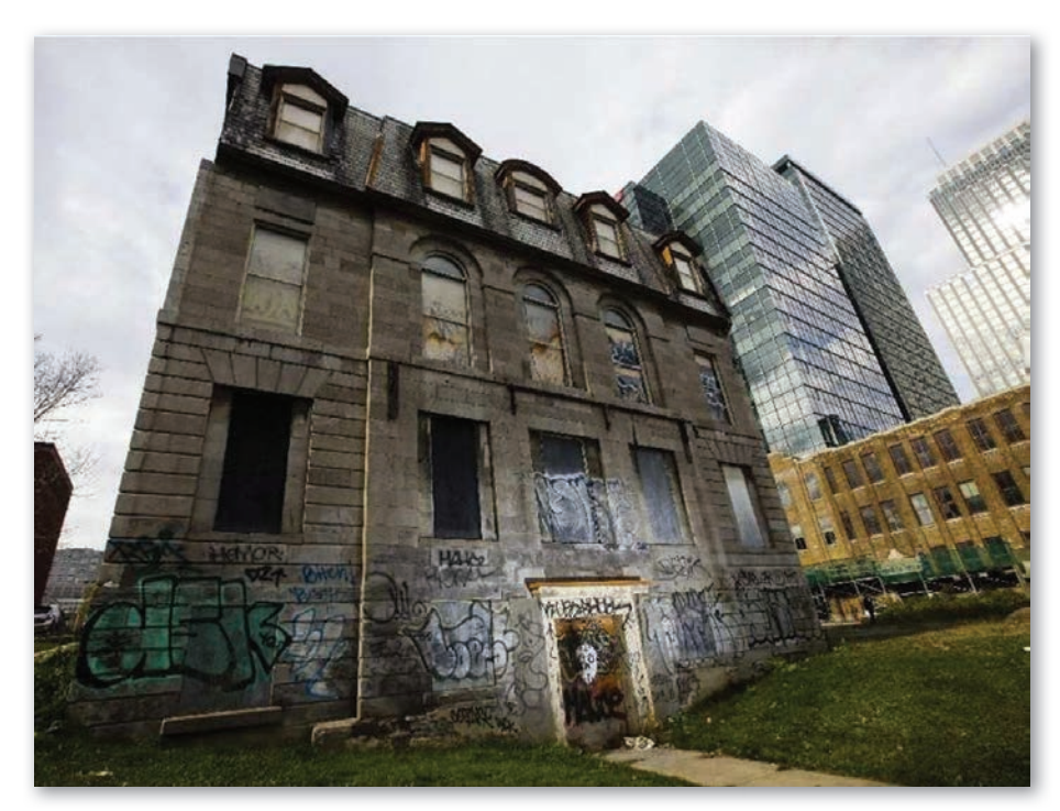
The House in 2015.