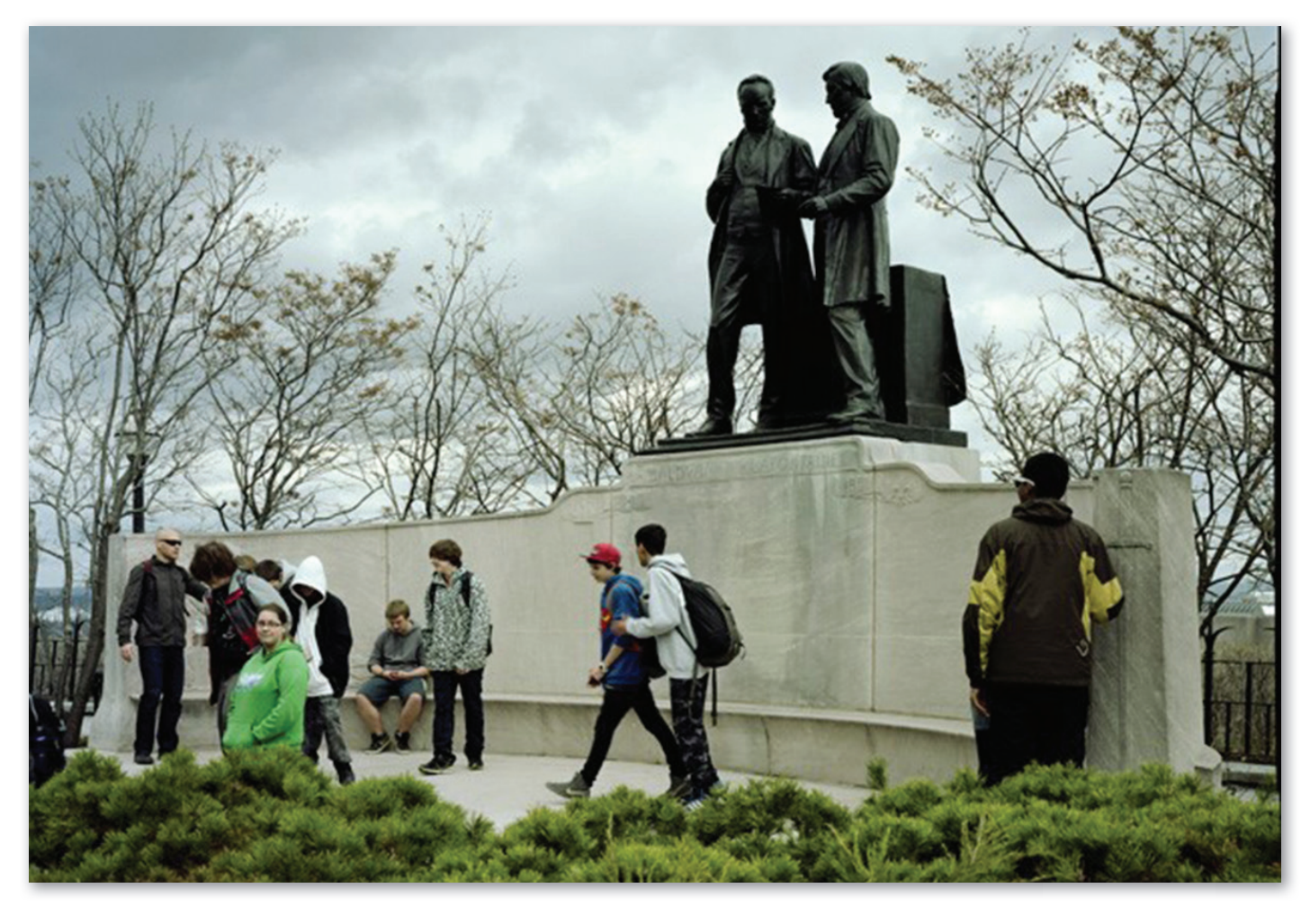
Baldwin-LaFontaine Monument Parliament Hill.