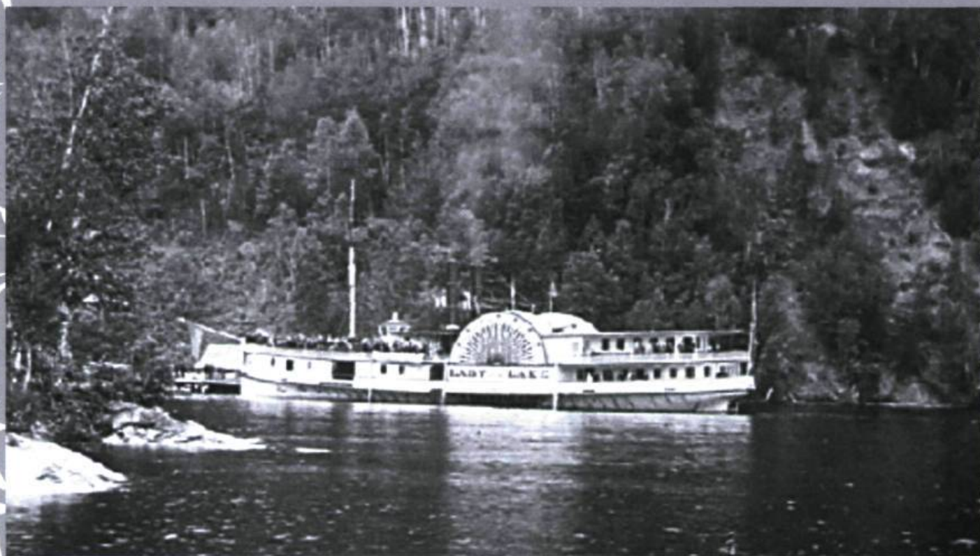
Lady of the Lake , c. 1887.

tain Maid , the first steamboat to navigate in the south of the province, was launched at Georgeville. This was the beginning of a full century of steamer operations on the lake, used mostly to carry resort visitors. During the second half of the XIX th century, seven other steamboats operated on the lake, the most important being the Lady of the Lake and the Anthemis , both of which offered a regular shuttle between