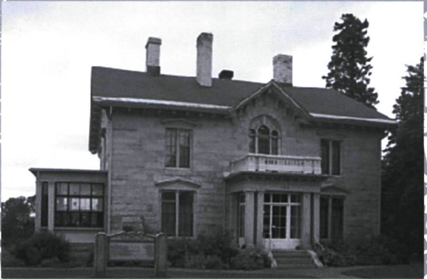
Carrollcroft, 1859.

Also located in Stanstead, the Ursulines Convent, first erected in 1884, is in the neoclassical style favoured by most catholic convents in Quebec. The original building with its mansard roof recalls the Ursulines long history as the first teaching order in Nouvelle-France. A second wing was erected in 1894 and a third, built in 1907, is featured in the photograph. As the convent's chapel is located in this wing, the roof is adorned with an elegant steeple, a traditional feature in Quebec convent architecture.