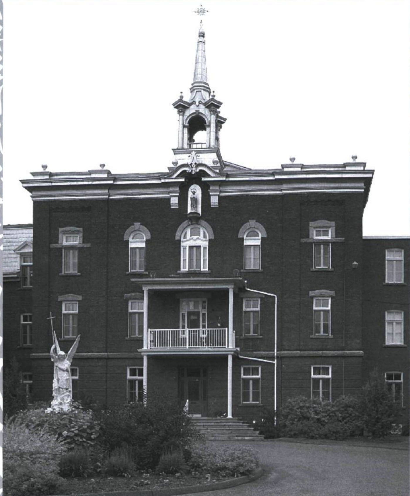
Couvent des Ursulines, 1884, Stanstead.