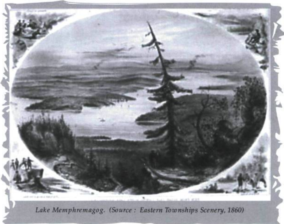
Lake Memphremagog. (Source : Eastern Townships Scenery , 1860)

architecture. The symmetrical, rectangular block features three arches at the center of the main façade, with a gable roof pierced by dormers and crowned by a cupola. Set back from Dufferin Road and enhanced by an attrac-