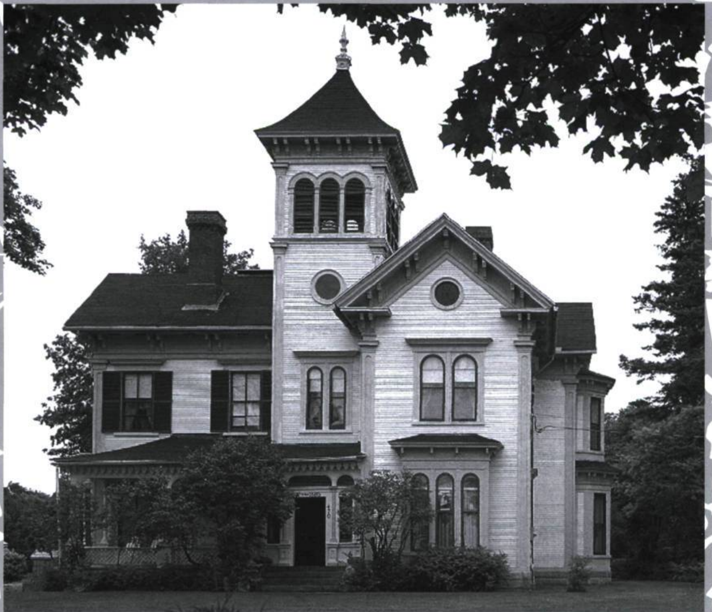
The Butters Residence, c. 1863, Stanstead.

It operates a charming seasonal museum at Eaton Corner, in an old Congregationalist church dating from 1841, now classified as a heritage building. Open during the summer season, the museum presents artefacts related to the lifestyle of the region's American pioneers.