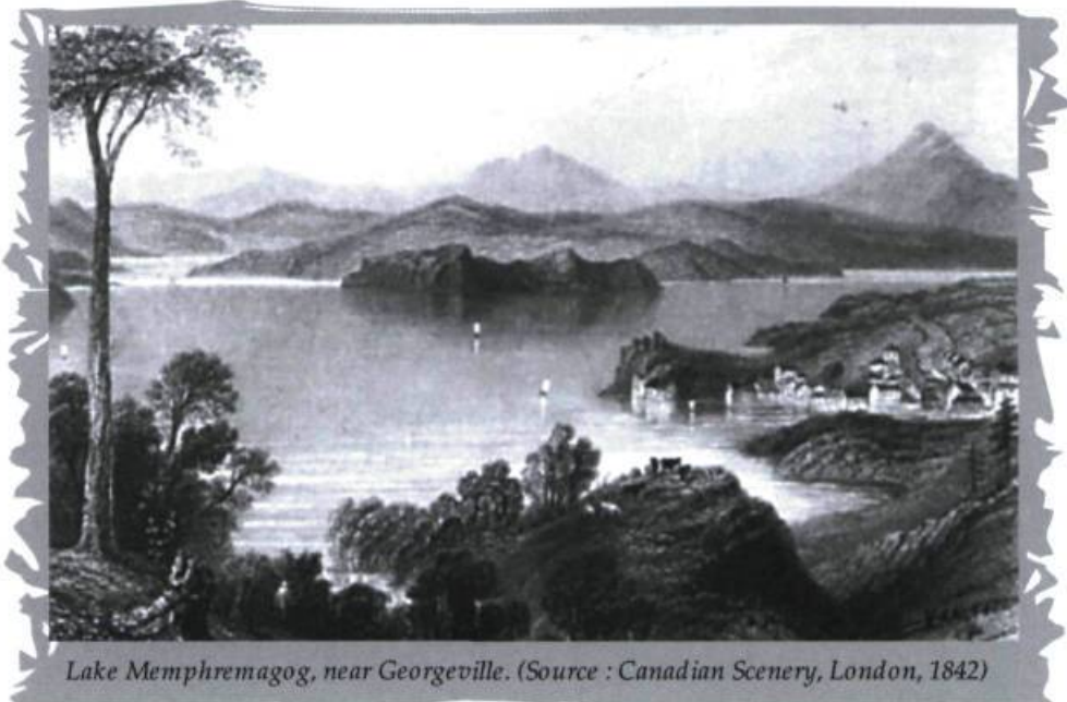
Lake Memphremagog, near Georgeville.

Designed in 1939 by the American-born architect Ernest Isbell Barott to replace the main building of Stanstead College, destroyed by fire, this handsome red brick pavilion shows the influence of American colonial