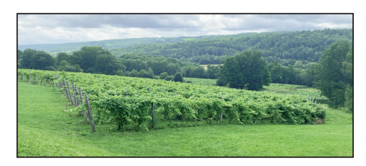
Benjamin Bridge Vineyards, view looking northeast over the Gaspereau Valley.

late Cretaceous Castle gate, Blackhawk and Mancos Shale Formations" will be offered on May 13th for those interested in the application of Unmanned Aerial Vehicles (UAVs) to 3-D modelling of normally inaccessible and treacherous vertical canyons. This virtual field trip is offered by knowledgeable guides in a live session and includes a comprehensive summary document and video recording for participants.