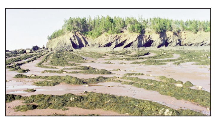
Folded Lower Carboniferous Horton Group at Split Rock, spectacularly exposed on the sea cliffs wave-cut platform of the macrotidal Bay of Fundy.

The CSPG sponsored "3-D Virtual Book Cliffs Tour, Coal Creek and Deadman Canyons, Utah; Sequence Stratigraphy and Sedimentology of Coastal plain, Shoreface and Offshore Successions of the