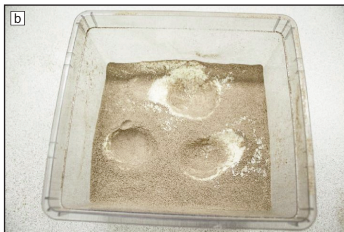
Figure 4. Meteorite impact structure(s) resulting from a rubber ball toss (a) and tosses thrown from varying angles and velocities (b).