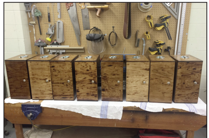
Figure 1. Transport cases for petrographic microscopes used for remote outreach activities.

Various methods have been proposed for communicating in outreach settings including the three prominent models for science communication (deficit, dialogue, and participation models; Metcalfe 2019). Among many issues (e.g. it assumes supremacy of western knowledge) the deficit model utilizes a one-way, top-down transmission of information from the presenter (expert) to the audience (layperson). This assumes that by audiences gaining more knowledge, they will inevitably have a positive attitude towards the topic (Reincke et al. 2020). The dialogue model is a form of two-way communication involving a transfer of information between presenter and layperson and vice-versa. It builds on mutual respect, encourages listening and learning, with the audience as a helpful resource and the expert as the facilitator (Reincke et al. 2020). Lastly, the par-