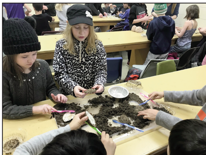
Figure 3. Students carefully using toothbrushes to uncover their fossil casts.

Meteorite Impact Lesson: Students were given a quick (~ 5 min) presentation on meteorites and meteorite impacts. Dr. Mel Stauffer kindly loaned meteorite specimens from his collection to use for the outreach program, including iron meteorites (the Toluca, Campo del Cielo, and Canyon Diablo meteorites) and a stone meteorite. These samples were carefully passed around under supervision by volunteers for 5–10 minutes. While samples were passed around, one volunteer set up the hands-on experiment, which demonstrates how a meteorite impact occurs. The volunteer used a clear plastic container and poured a layer of flour (~ 3 cm thick), and sifted a thin layer of cocoa powder (~ 2 cm thick) on top. Next, a student volunteer was asked to throw a small rubber ball at the cocoa powder in the container creating an impact crater (Fig. 4a). Students used their observational skills to draw the crater’s shape and discussed what factors could change it. Finally, a new volunteer threw the ball with a change in the angle, height, or speed (Fig. 4b).