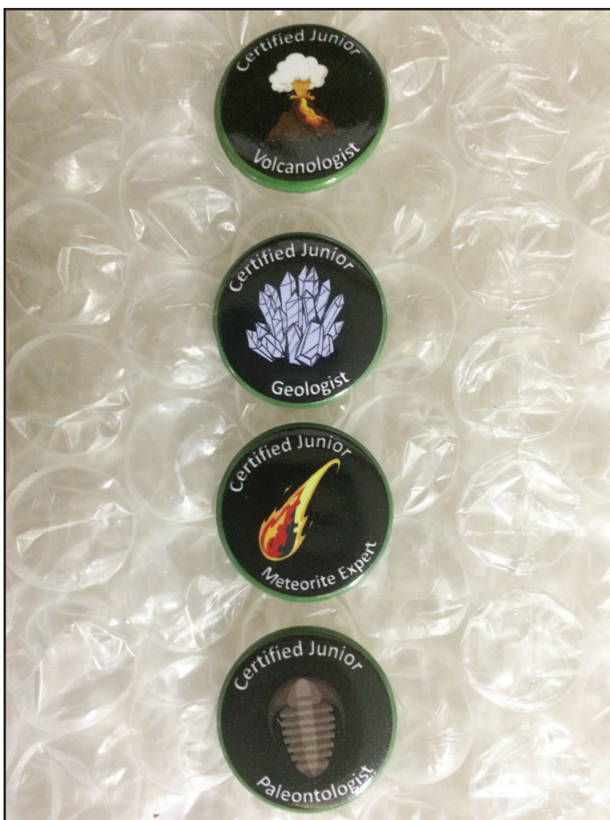
Figure 7. Badges distributed to students who completed our 'Rocks and Minerals', 'Fossils', 'Volcanoes', and 'Meteorite Impact' lessons.

'Rocks and Minerals' activity. Based on their answers, the percentages of students who enjoyed particular components most were as follows: 50% of students enjoyed the museum tour, 30% liked looking at samples under the microscope, 10% enjoyed looking at rock and mineral hand samples, whereas 5% enjoyed the mineral matching activity and 5% couldn't decide and enjoyed everything. When asked what they learned, here are some typical responses: