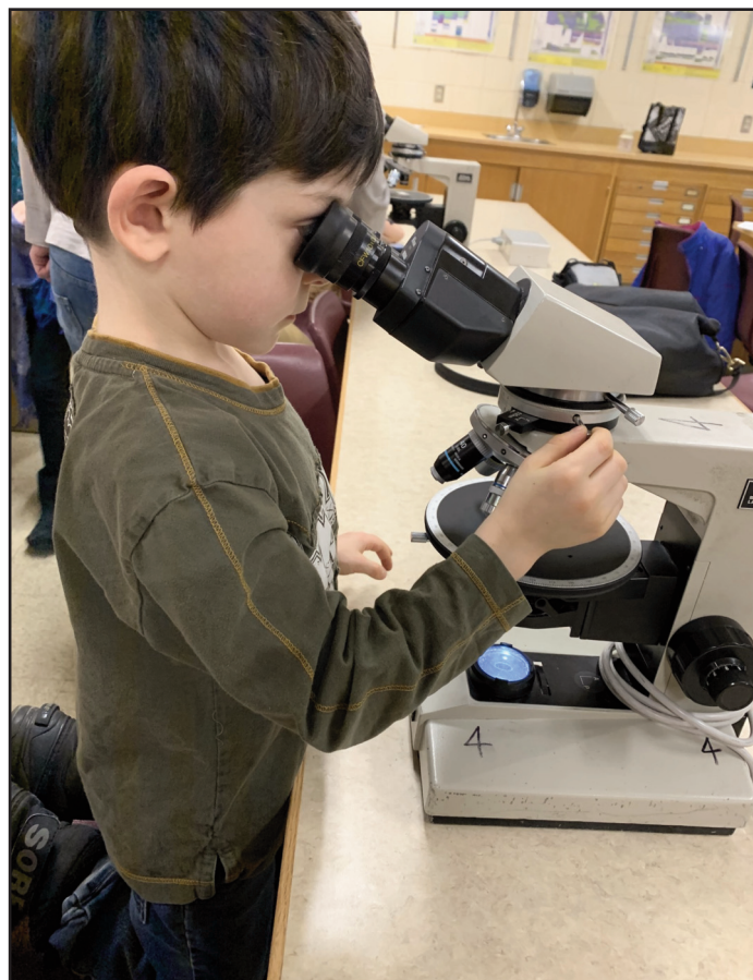
Figure 2. Homeschool student observing minerals under a petrographic microscope.

Following this activity, we looked at minerals under a microscope. Before starting, to ensure that the students handled the microscopes carefully, presenters told students that each microscope was worth $1,000,000; this exaggeration was justified in emphasizing that students should use extra caution! This was the student's first time seeing rocks under a microscope (Fig. 2), so no advanced observations were made. Instead, a volunteer switched between cross-polarized and plane-polarized light and sometimes inserted the gypsum plate, to get students' attention!