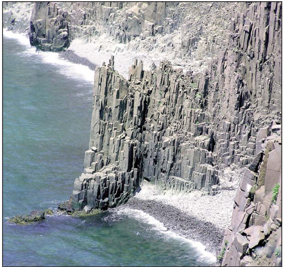
Figure 4. Colonnades in the Triassic Dark Harbour Basalt.

Participants are limited to 25 people and while on the island will travel together by shuttle bus. The field trip fee includes bus transportation from Fredericton to Blacks Harbour on Friday, the shuttle bus, ferry travel on foot both ways, bag lunches both days, dinner at the Inn on Saturday evening, and bus transportation from Blacks Harbour to Fredericton on Sunday afternoon. Accommodations and other meals are extra and the participant's responsibility, however, participants are encouraged to stay at the Marathon Inn in North Head ( http://marathoninn.com/ ; 506-662-8488 or toll free 888-660-8488) where the trip will be based. Please be sure to reserve your room well in advance, as bird watchers flock to Grand Manan in May. Alternate accommodations are available at the Surfside Motel (506-662-8156), located about 1.5 km from the ferry terminal, or at one of several B & B's in the area.